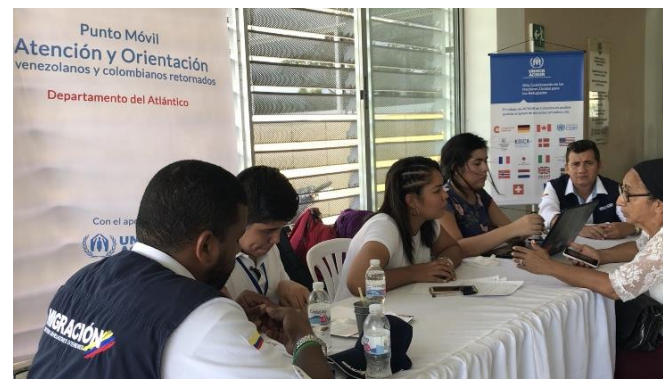
Information and Orientation Points in municipality of Suan, Atlántico during the day of attention and orientation for Venezuelans.