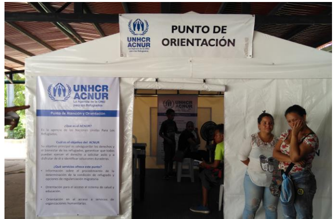
Information and Orientation Kiosk in Simón Bolívar Bridge, in Cúcuta.