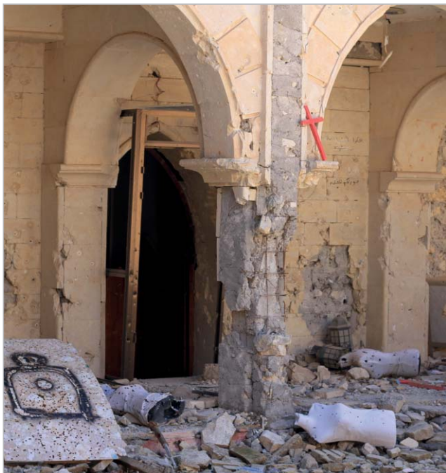
THE DESECRATED CHURCH OF THE IMMACULATE CONCEPTION IN QARAQOSH, USED BY ISIS FOR TRAINING FIGHTERS AND TARGET PRACTICE

This section discusses some of the challenges that displaced minority members continue to experience in Iraq almost three years after the fall of Mosul to ISIS.