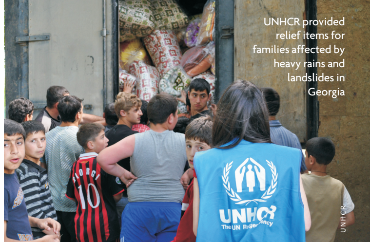
UNHCR provided relief items for families affected by heavy rains and landslides in Georgia

Development Assistance Framework 2011-2015, advocating for the inclusion of refugee and IDP issues in the development agenda, and in the Abkhazia Strategic Partnership Group negotiating humanitarian space and access.