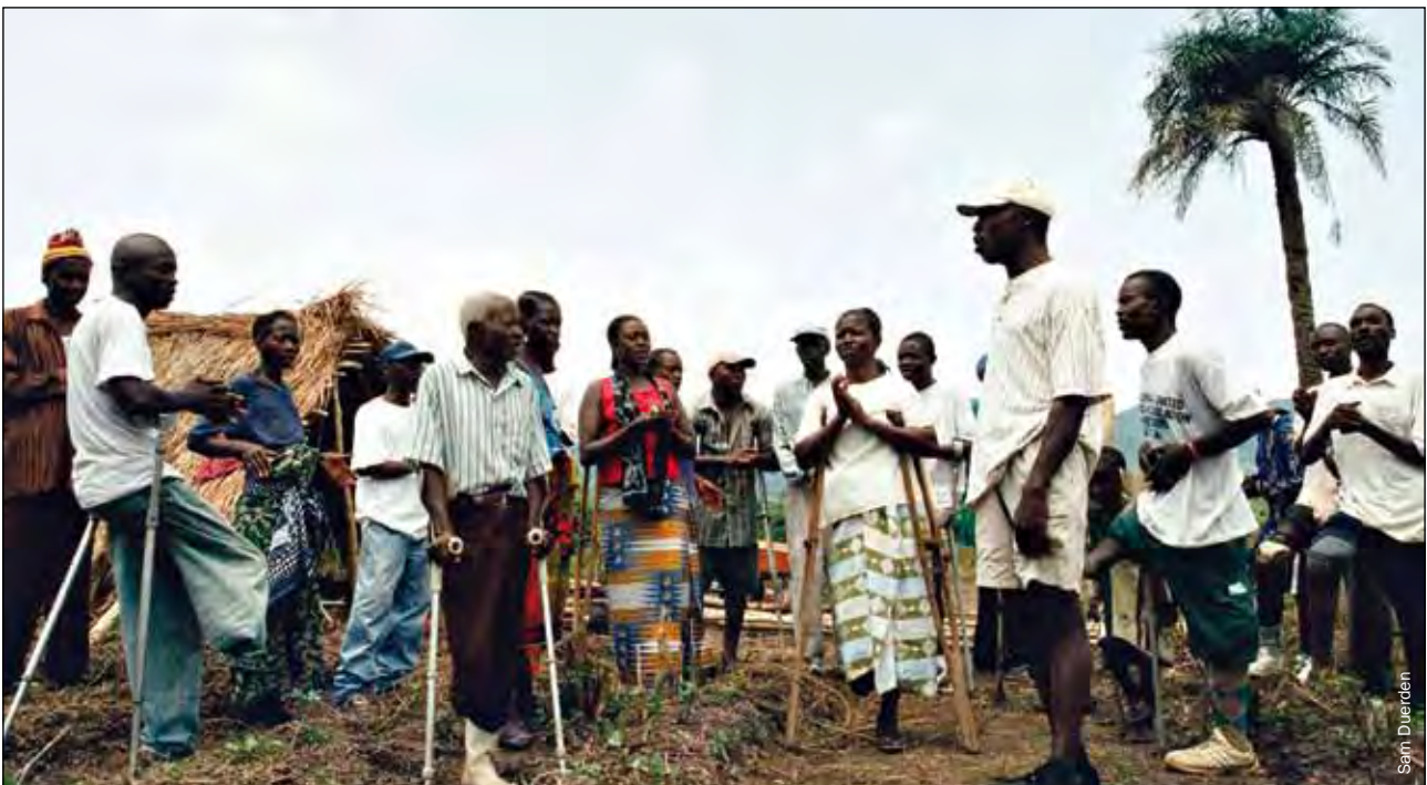
Kenema, Sierra Leone.