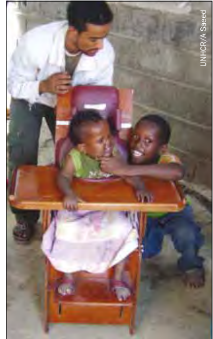
High chair for refugee child made by persons with disabilities enrolled in vocational training run by the Association for Developing People with Special Needs, Aden.

The survey highlighted numerous shortcomings in interventions targeting refugees living with disabilities. These included inadequate referral for specialised treatment, lack of any optical or hearing health services (despite significant numbers of refugees suffering from visual or hearing impairments), a lack of assistive