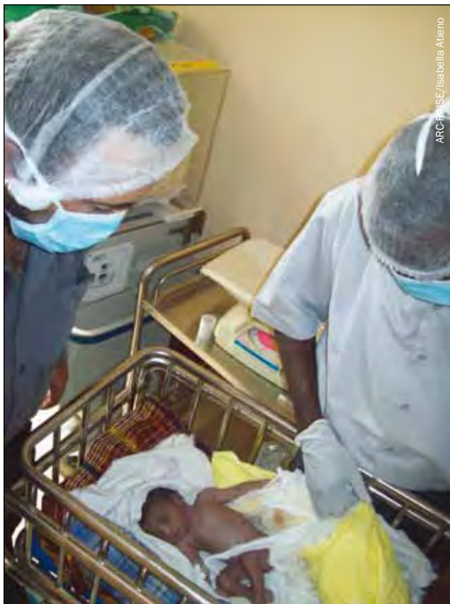
The new EmONC Centre in Gereida provides comprehensive emergency obstetric and neonatal care.

EmONC includes the ability to carry out surgical interventions (specifically caesarean sections) and blood transfusions, both of which are crucial to managing obstetric complications. When EmONC services are low quality,