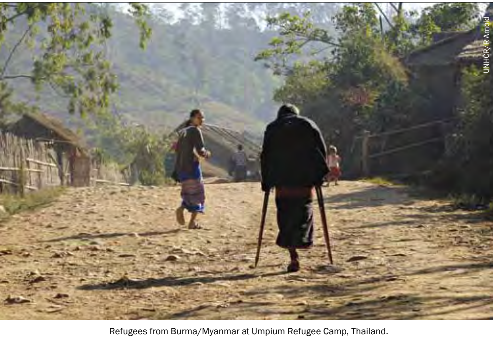
Refugees from Burma/Myanmar at Umpium Refugee Camp, Thailand.

In the past, UNHCR has made attempts to encourage resettlement countries to accept disabled refugees and those with special medical needs. One such attempt was the establishment of the 'Ten