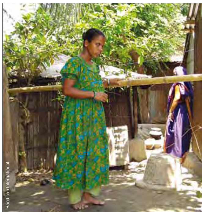
Woman with visual impairment using handrail for guidance in a temporary settlement (Bangladesh).

More often than not, temporary shelters, water and sanitation facilities and other infrastructure (temporary health centres and schools, camp offices, etc) are not accessible for all displaced persons. Uncovered drainage channels, tent ropes, uneven surfaces, steps or narrow doors can impose significant mobility restrictions for persons with visual or physical impairments. Long distances between water