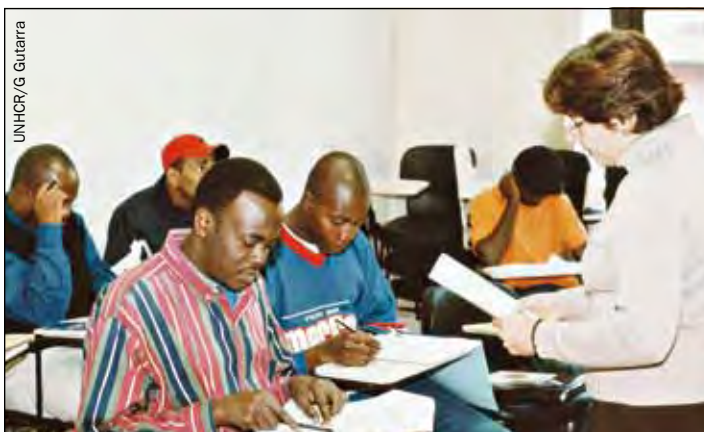
Resettled refugees in language class, Brazil.

The full application of regulations for the international protection of the human person and actions undertaken to consolidate this state policy are of genuine concern to Brazilian society whether through government or civil society action, or both together. For example, Brazil has undertaken a refugee resettlement programme in close collaboration with civil society and UNHCR. Brazil and UNHCR signed the Macro Agreement for the Resettlement of Refugees in Brazil in 1999. However, it was not until 2002 that Brazil received its first group of resettled refugees. The group consisted of 23 Afghans who were settled in Rio Grande do Sul. However, owing to Brazil’s lack of experience in the resettlement of refugees, the gap between Afghan and Brazilian culture and UNHCR’s