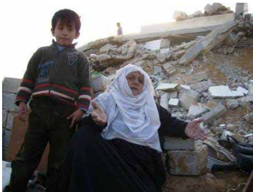
Homeless after the destruction

More than 3,000 homes and hundreds of other properties, including factories, workshops, animal farms and orchards, as well as government buildings, police stations and prisons, were destroyed and more than 20,000 were damaged during Operation “Cast Lead”. 88 The Israeli authorities’ explanation for such devastation was “military/security necessity”.