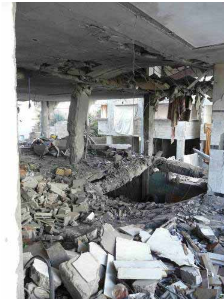
Abu 'Aisha family house, bombed on 5 January 2009

Saber, one of 'Amer's brothers who survived the attack, told Amnesty International: "In 2006, the Israeli army telephoned me on my cell phone and told me to open the windows and move my family to the back of the house because they were going to bomb the building opposite my house where a Hamas police post was located. They then called again five minutes later and asked me to tell my neighbour to leave his house, which was nearer to