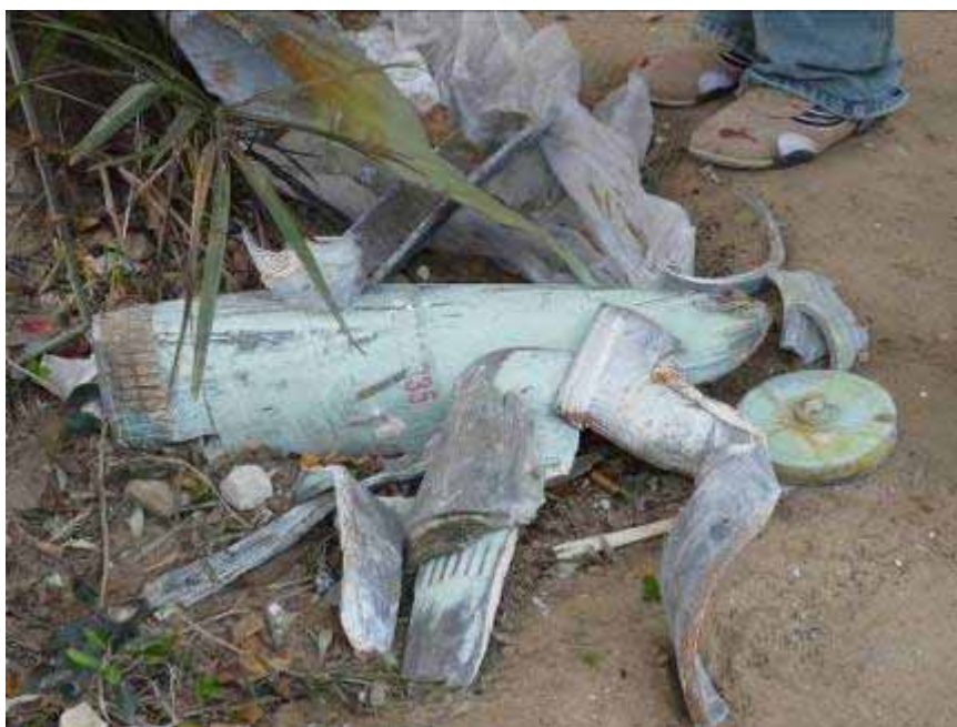
Fragments of a US-made M155 white phosphorus carrier artillery shell fired by Israeli forces into Gaza

When Amnesty International delegates visited the compound four days after the attack, fires were still burning in some of the warehouses, notably those where cooking oil, flour and other highly combustible food items had been stored. The workshops and other warehouses were completely charred. Both the buildings and their contents were completely destroyed. At the compound Amnesty International delegates found fragments of several white phosphorus artillery shells, some with the serial markings still visible, and of at least one high-explosive artillery shell. 48