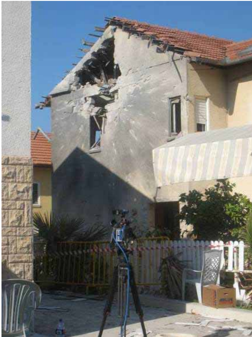
The Ben Dayan home in Ashkelon after it was hit by a Palestinian rocket on 12 January 2009

In recent years thousands of residents of Sderot, between 10 and 12 per cent of the population of some 20,000, have moved to other parts of the country, out of range of the rocket attacks. The economic situation in the town has suffered as a result, and many businesses have been forced to close their doors. Many more residents would leave if they could afford to but they can neither sell nor rent their homes.