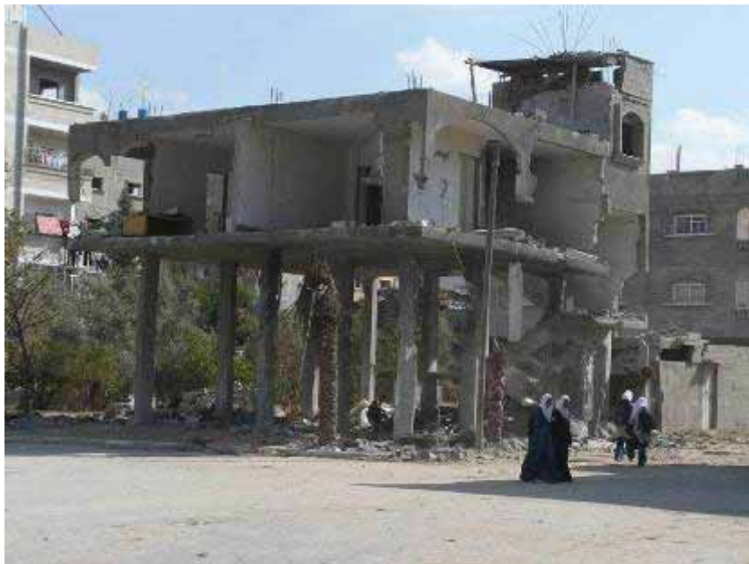
Salha family house, bombed on 9 January 2009

scrambled to get out of the house. They had run out first and so survived, while their mother, siblings and one aunt had only managed to get to the bottom of the stairs when the house was bombed.