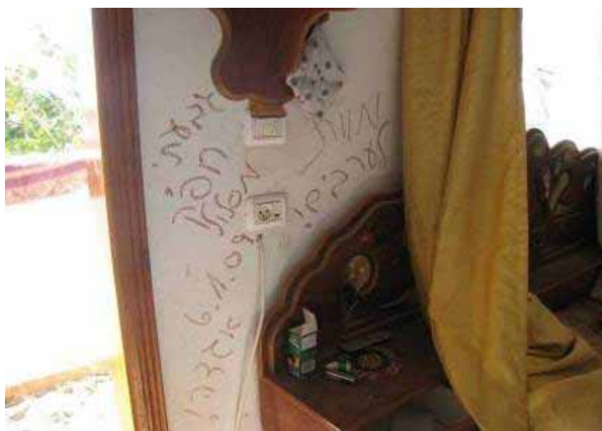
"Death to the Arabs": graffiti in Hebrew signed by the Givati Brigade of the IDF in the al-Sammouni family home.

Threatening graffiti such as "Death to the Arabs", "we came to annihilate kill you" or "a good Arab is a dead Arab", which was left by soldiers in houses which they had used, and often gratuitously vandalized, raise further concerns about the mindset of certain soldiers and their commanding officers, and raise questions as to whether, as well as carrying out reckless and indiscriminate attacks, soldiers at times also deliberately targeted civilians.