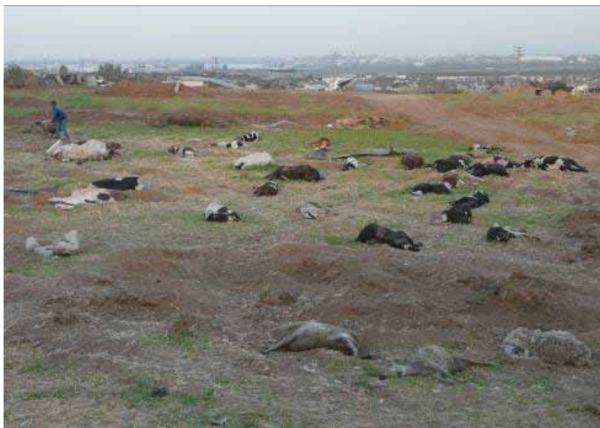
Dead animals by destroyed farm in northern Gaza

Large tracts of Gaza's most productive land, which until a few years ago produced much-needed food for the tiny territory's growing population, have been turned into condemned