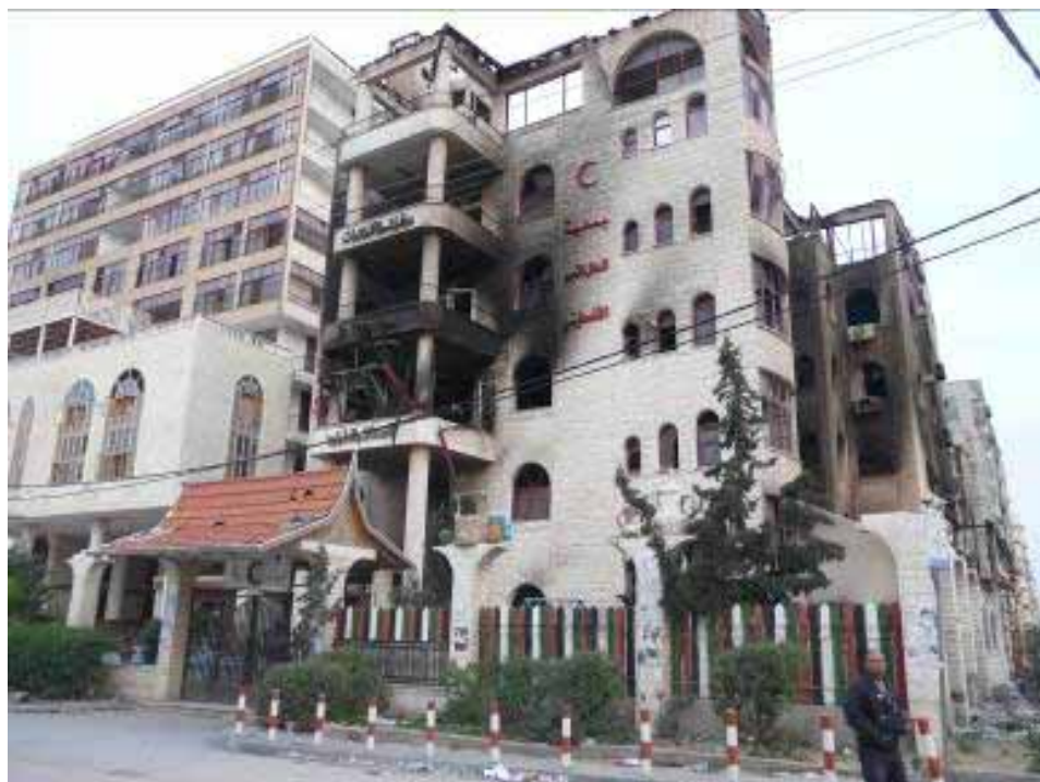
Al-Quds hospital

By the afternoon the hospital managed to arrange for co-ordination, via the ICRC, to evacuate the hundreds of civilians who had taken refuge in the hospital to an emergency UNRWA shelter. Meanwhile, hospital staff battled the localized fires which kept reigniting. In the evening, when more white phosphorus hit the hospital, the staff were forced to leave, taking the patients out in their beds and pushing the beds along the road away from the building. The patients were eventually transferred to al-Shifa hospital. A medicine store, in a small separate building around the corner from the hospital, was burned to the ground, seemingly having likewise been struck by white phosphorus. Two ambulances were burned and crushed near the hospital.