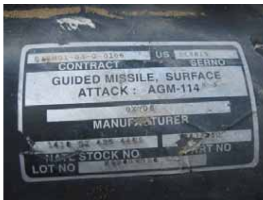
Israeli artillery and mortar shells in Gaza (left); remains of a US-made Hellfire missile which killed three paramedics and a child (see Chapter 1.4.1)