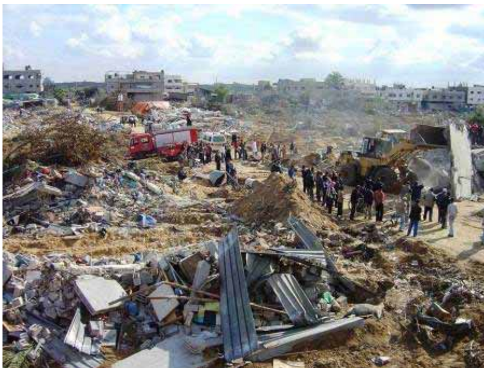
Bodies of members of the al-Sammouni family being retrieved on 18 January 2009

One of the most shocking cases is that of the al-Sammouni family , who lost 31 members of their extended family in the al-Zaytoun neighbourhood, in the south-east of Gaza City . Most of those who perished were killed when one of the family homes, that of Wa'el al-Sammouni , was shelled, seemingly with tank rounds, on 5 January 2009 , a day after Israeli soldiers had ordered dozens of family members to move there from a nearby house belonging to the same extended family. In addition to those killed in the attack, several other family members who had been wounded in it died in the following days as they remained trapped in the house because the army did not allow ambulances to reach the area. Several family members bled to death over a three-day period while they waited in vain for someone to rescue them. Children lay for three days without food or water next to the bodies of their dead mother, siblings and other relatives.