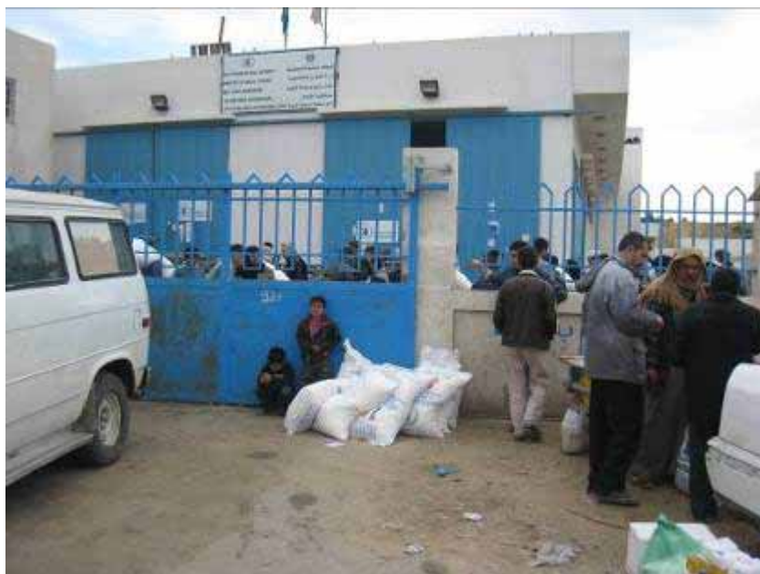
Waiting for food aid after the end of Operation "Cast Lead"

All this meant that the 22 days of intense bombardment trapped tens of thousands of families in their homes with