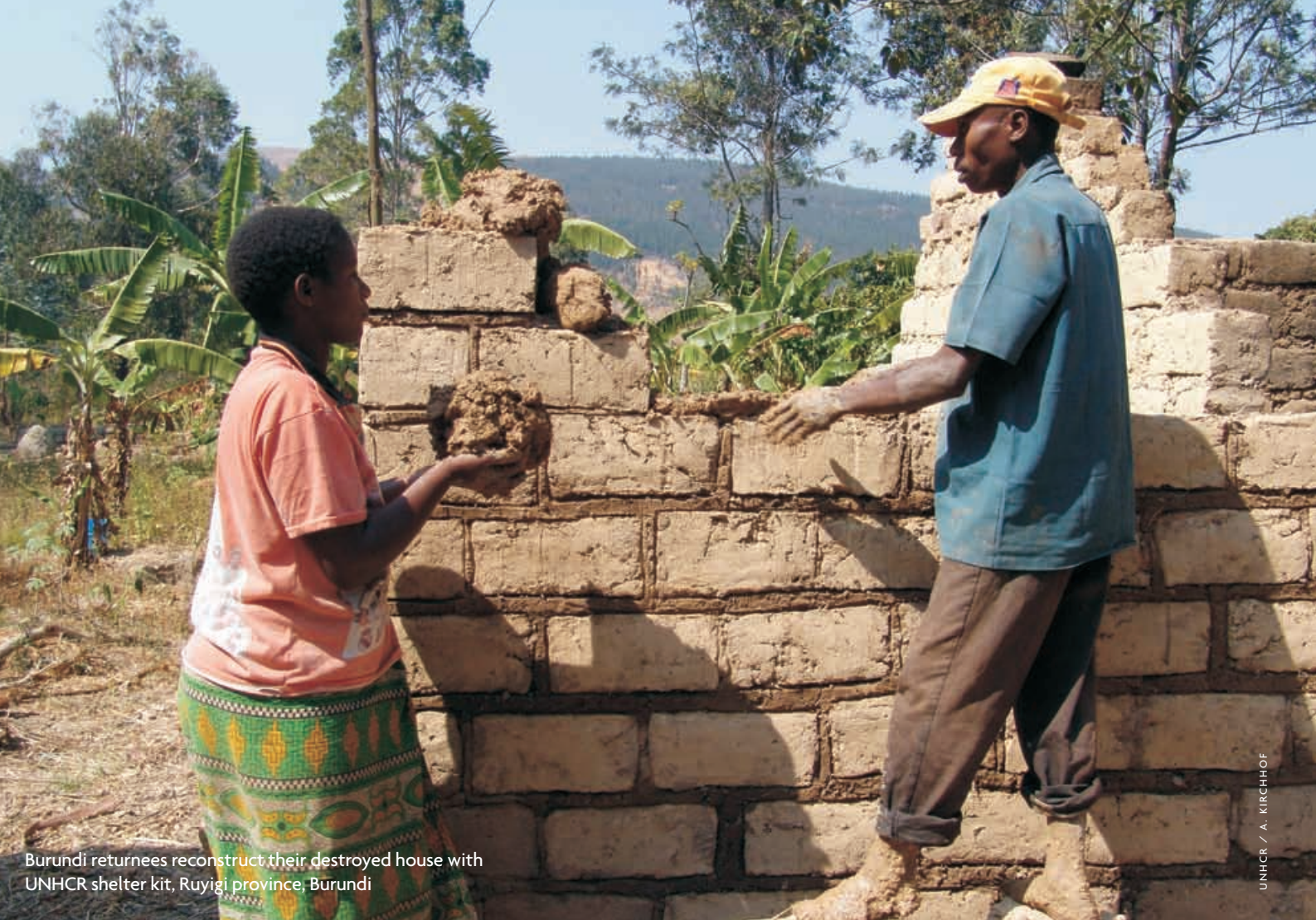
Burundi returnees reconstruct their destroyed house with UNHCR shelter kit, Ruyigi province, Burundi