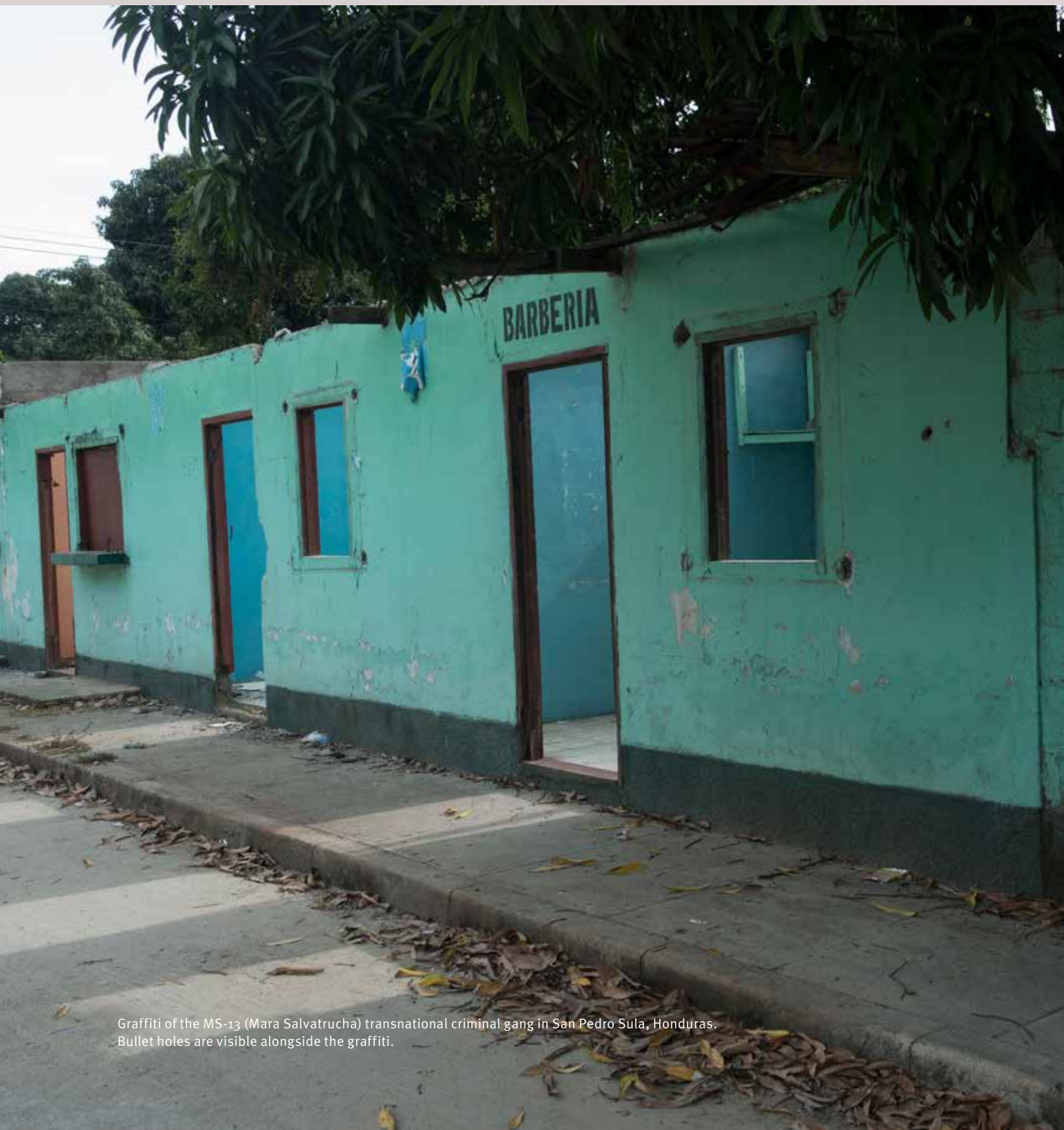
Graffiti of the MS-13 (Mara Salvatrucha) transnational criminal gang in San Pedro Sula, Honduras. Bullet holes are visible alongside the graffiti.