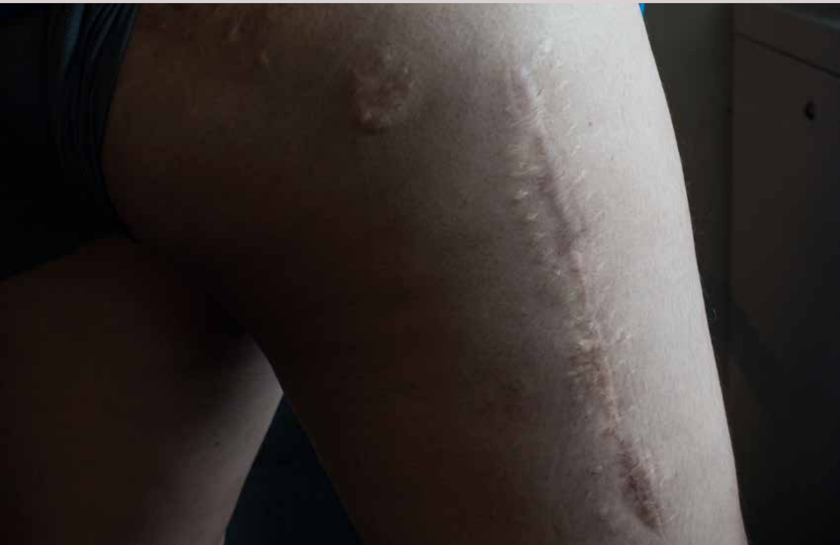
Man shows scars from bullet wounds from gang attack that prompted him to flee to the United States. He is now back in San Pedro Sula after having been deported.

forcibly recruiting a family's young son. Others fled abusive domestic partners or violence related to sexual orientation, both grounds for asylum under US law.