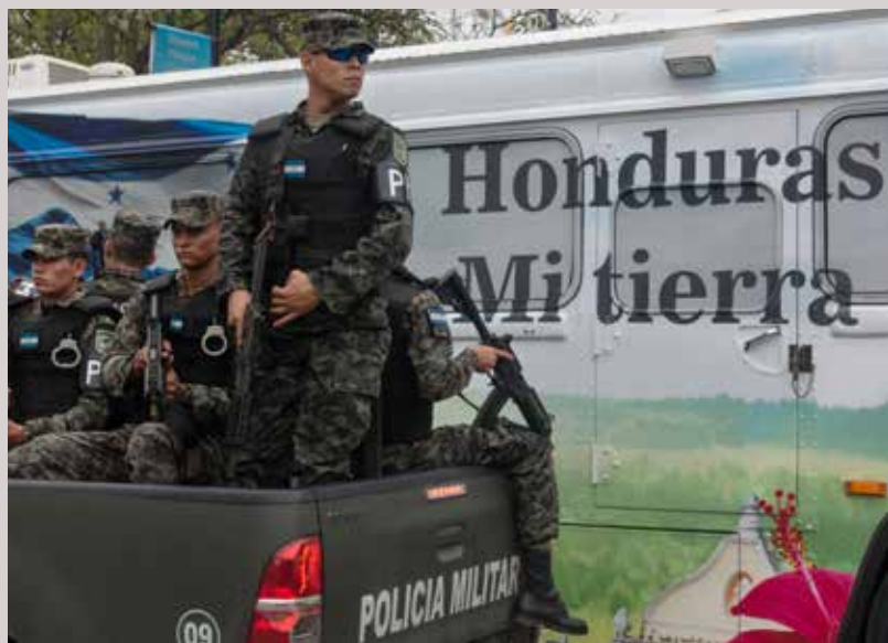
Honduran military police beside a bus with “Honduras is my land” painted on the side in downtown San Pedro Sula.

In the past two decades, US laws and policies have become less responsive to the risks faced by arriving migrants seeking asylum from persecution. In 1996, and subsequently in 2006, the US government severely undermined the system for identifying asylum seekers through the establishment and expansion of expedited removal. The flaws of that approach are readily apparent today at the US-Mexico border.