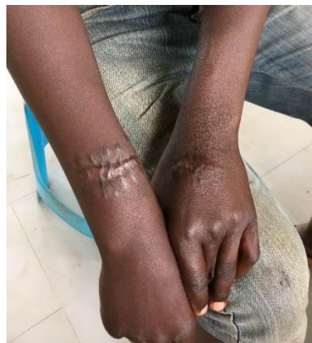
A Burundian refugee shows his torture scars

An FNL member reported that SNR officers beat him during arbitrary detention in their detention centre in Ngozi, using batons with barbed wire. He said he was later transferred to