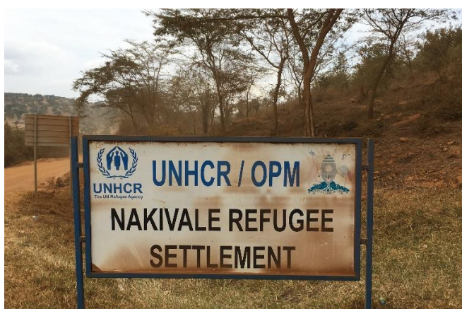
Signpost at the entrance of Nakivale Refugee Settlement

On 1 August 2017, IIRI wrote a letter with a summary of its findings and questions to UNHCR, the Ugandan Commissioner of Refugees at the Office of the Prime Minister (OPM) and the Burundian Ministry of Interior and Patriotic Education. Only OPM responded and these responses are integrated in the report. IIRI would like to thank OPM for responding to the letter and for granting access to the refugee settlement. IIRI also spoke to several humanitarian workers in Nakivale and would like to thank them for helping to facilitate the research.