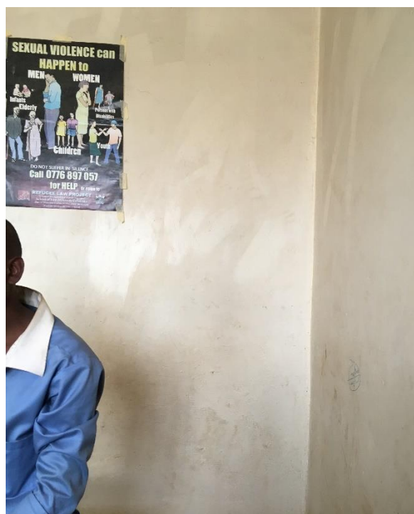
A Burundian refugee below a poster about sexual violence

The other man said: “There is insecurity here, because there are Imbonerakure who come here. I informed the authorities [in Nakivale settlement] about it, but no protection measure has been put in place. I recognised two of them, I knew them from Burundi.” 93 Despite a request, UNHCR