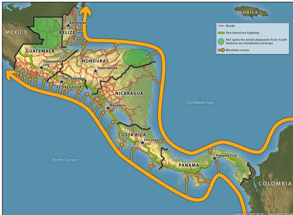
Figure 3. Central American Drug Trafficking Routes