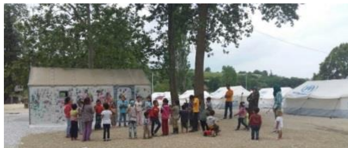
As part of the community-mobilization efforts, UNHCR and partners organized children activities and a workshop to assemble benches out of wooden pallets at Lagkadikia relocation site ©UNHCR/M. Bariot, 20 May 2016.