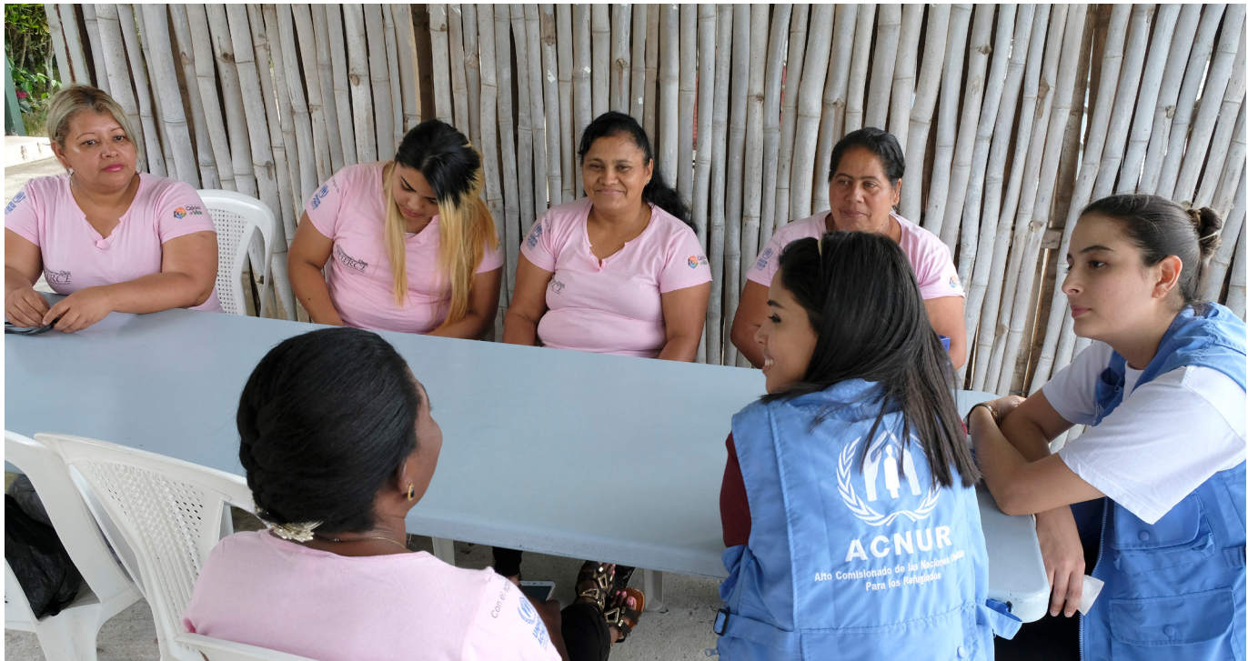
Honduras. Helping gang-affected communities in city ravaged by violence

The purpose of this document is to provide an overview of key developments affecting the displacement situation in the Americas and some of UNHCR response activities in line with the 2019 strategic objectives for the region.