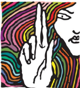
Hungarian Helsinki Committee