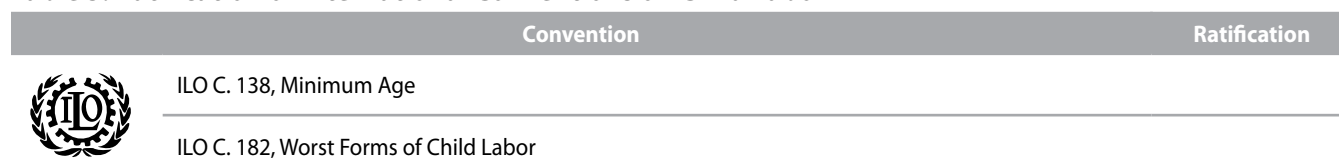
Table 3. Ratification of International Conventions on Child Labor

The following convention has been extended to Anguilla (Table 3).