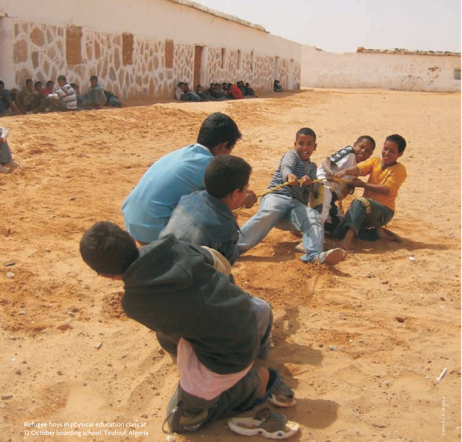
Refugee boys in physical education class at 12 October boarding school, Tindouf, Algeria