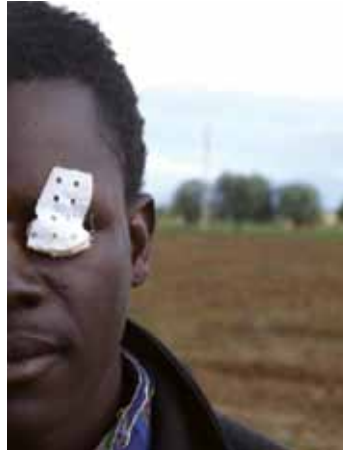
Migrant shot in the eye by Spanish border guards

wire and severely damaged his skin all along his wrists, arms and back. 58 Despite receiving treatment in Morocco, most migrants upon arrival or return to Maghnia are unable to have any check-ups for their injuries, often resulting in a worsening of their injuries over time. 59