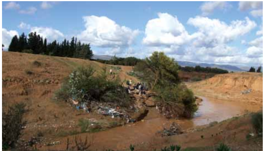
Migrants near the riverbed (winter)

Migrants located in Maghnia and in its surroundings live in very precarious conditions with inadequate housing, poor hygienic conditions, and lack of real access to health care.