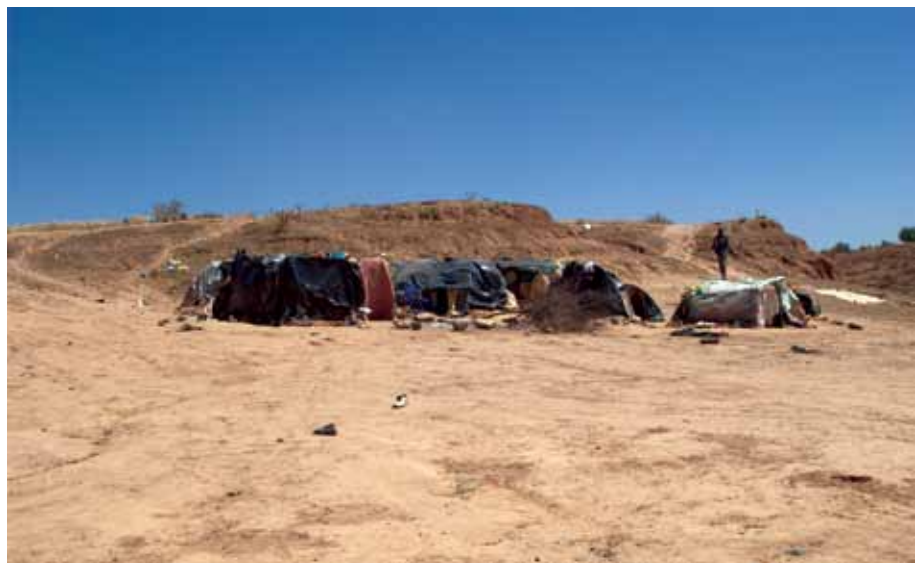
The camp of the Senegalese migrants (summer)