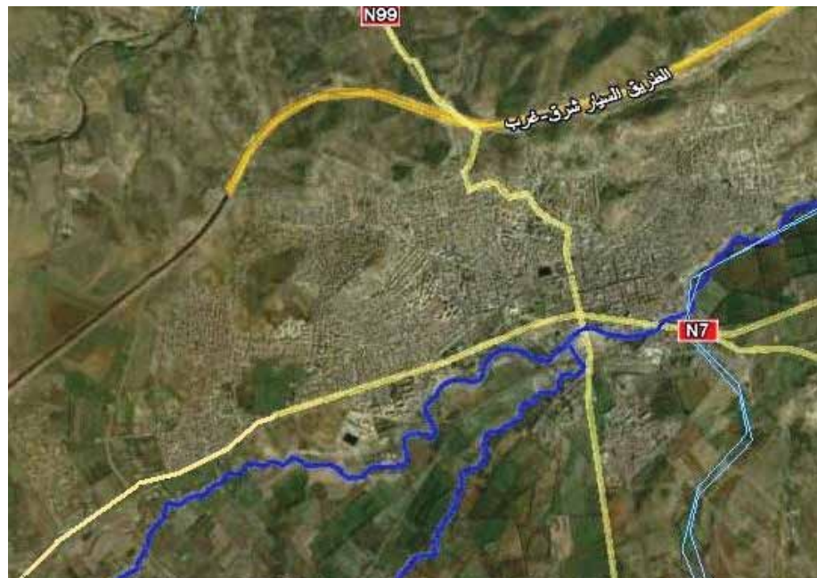
View of Maghnia and its surroundings from above: The N7 road separates the city from the agricultural fields and the two creek valleys where Sub-Saharan communities are located

Migrants from Sub-Saharan Africa live both in the city of Maghnia and its outskirts. The three main areas of settlement include: a) the city itself, b) construction sites, barracks and other precarious settlements in the vicinity of the city; and c) the valleys of two creeks (Oueds) – Ouerdefou et Aounia, two affluents of the Tafna river – in the outskirts of the city, in the direction of the border with Morocco.