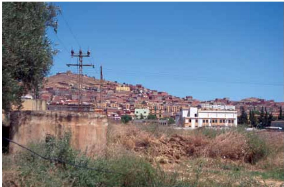
View of Maghnia from its outskirts

Interviewees claim that Sub-Saharan migrants were already taking this route into Morocco around 1995-1997, with pioneers relying on very little resources to organize the border crossing. Migrant strategies were initially improvised, with migrants staying in informal dormitories or camping in construction areas in the suburbs of the city. Only between 2001 and 2003 did the route become institutionalised, as the number of arrivals as well as average length of stay increased. Between the late 1990s and the early 2000s, the largest groups transiting Maghnia were from DRC Congo, Ivory Coast and Sierra Leone. With time, the Sub-Saharan presence further diversified, to include also Mali, Guinea Bissau, Guinea Conakry, Ghana, Gambia, Cameroon, Burkina Faso and Senegal.