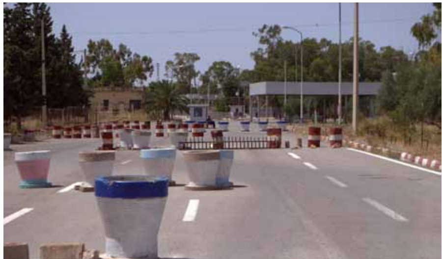
The Maghnia-Oujda border post, officially closed since 1994 (view from Algeria)

Maghnia is a small town with no real industrial development and few tourist, employment or business activities. It is highly militarized, with border police, gendarmerie and security services constantly monitoring the inner city and its surroundings, as well as a network of informants and collaborators among regular citizens keeping the authorities informed of what happens. The closure of the border since 1994 – after the two countries repeatedly exchanged accusations of subverting activities 24 – has spurred the development of a black market and increased levels of criminal activity with the complicity of local authorities in both Algeria and Morocco, from smuggling of drugs or ordinary goods (from gas to olive oil, or goats) to human trafficking. Prostitution networks are also said to have developed along the border without the authorities in either country being able or willing to take effective countermeasures [MSF, 2013; MSF, 2010; Laacher, 2010].