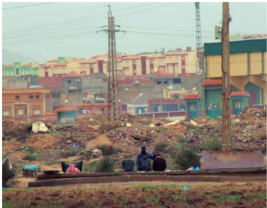
Sub-Saharan migrants in the outskirts of Maghnia