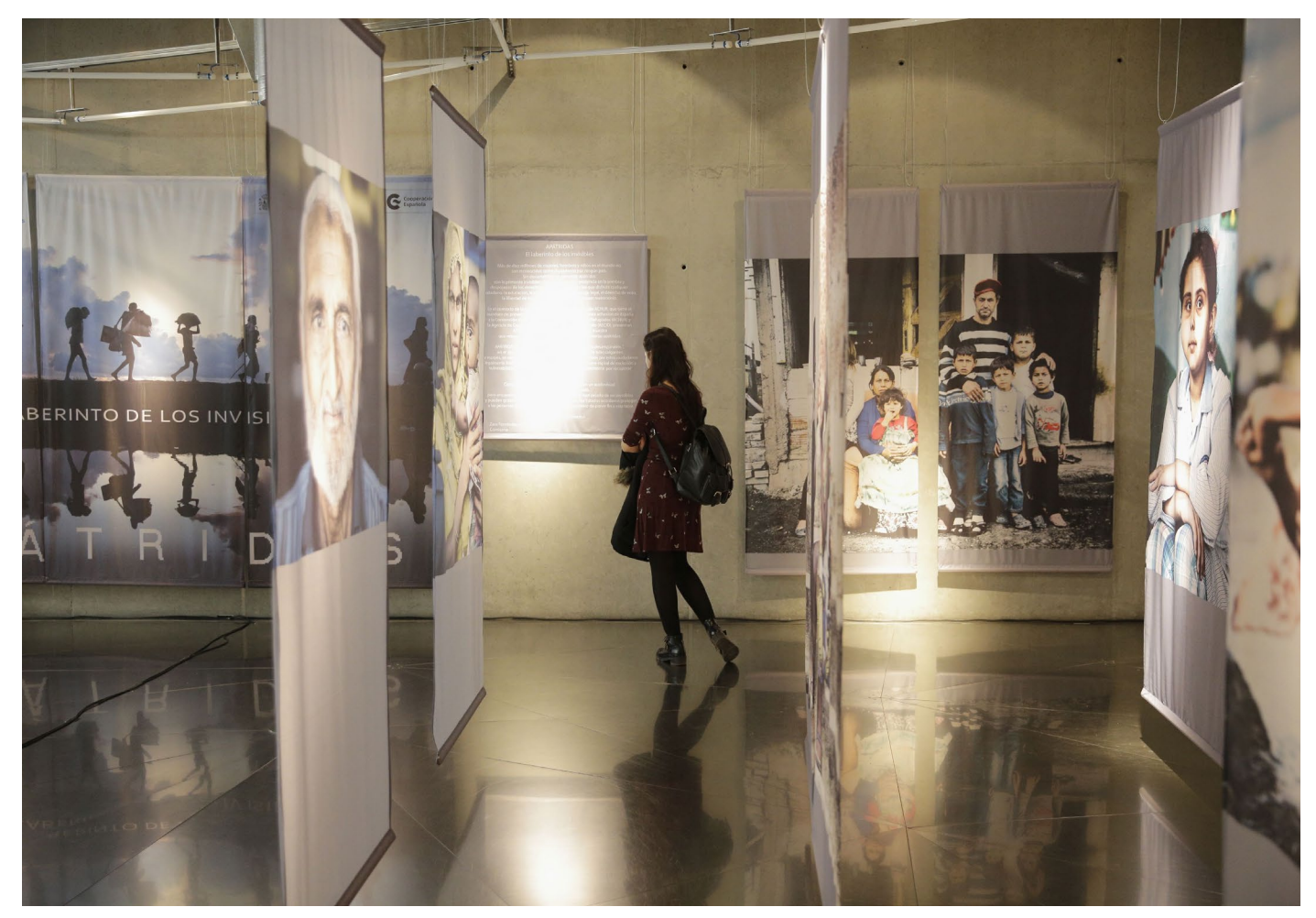
"Stateless. The labyrinth of the invisible", a photo exhibition launched by the UNHCR and the Spanish Agency for International Development Cooperation (AECID) in Madrid, ©UNHCR/O. Calvo

On 14 November, a cinema played a short UNHCR #IBelong Campaign video on one of the main avenues in the center of Lisbon, Portugal to commemorate the fourth anniversary of the #IBelong Campaign. On the same day, one of the country's largest daily newspapers published an <u>editorial article</u> on UNHCR's mapping of statelessness in Portugal.