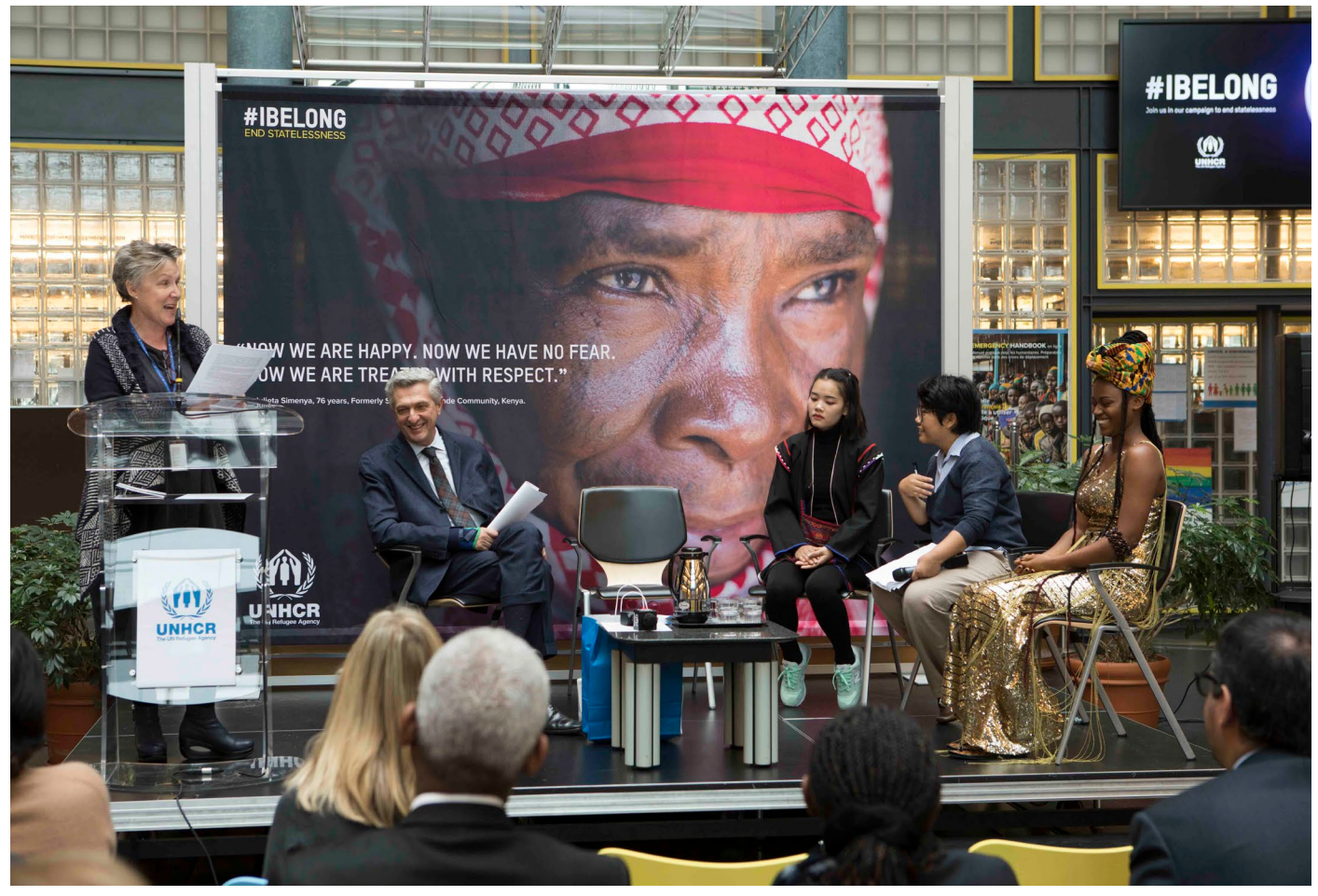
UNHCR marks the fourth anniversary of the #IBelong Campaign Update, Switzerland

On 10 and 11 October, the European Network on Statelessness convened an <u>advocacy workshop</u> in Strasbourg to take stock of what the #RomaBelong project has achieved so far, share learning and expertise, and strategize and prioritize action for the next phase of the project. The event brought together Roma civil society, NGOs and key regional institutions. At a separate event in Strasbourg on 10 October, the European Network on Statelessness convened a lunchtime reception where it presented its <u>Statelessness INDEX</u>, an online comparative tool that assesses how countries in Europe protect stateless people and what they are doing to prevent and reduce statelessness. The event also provided a forum to discuss recent action taken and future activity by the Council of Europe.