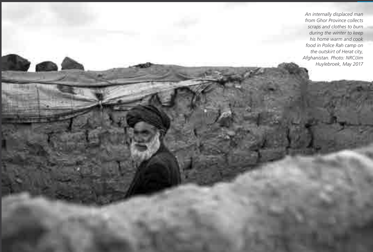
An internally displaced man from Ghor Province collects scraps and clothes to burn during the winter to keep his home warm and cook food in Police Rah camp on the outskirts of Herat city, Afghanistan.

cannot be addressed by humanitarian interventions alone. 179 A shift from humanitarian to development planning, and from national to local implementation is not just a generic recommendation but an urgent priority. 180