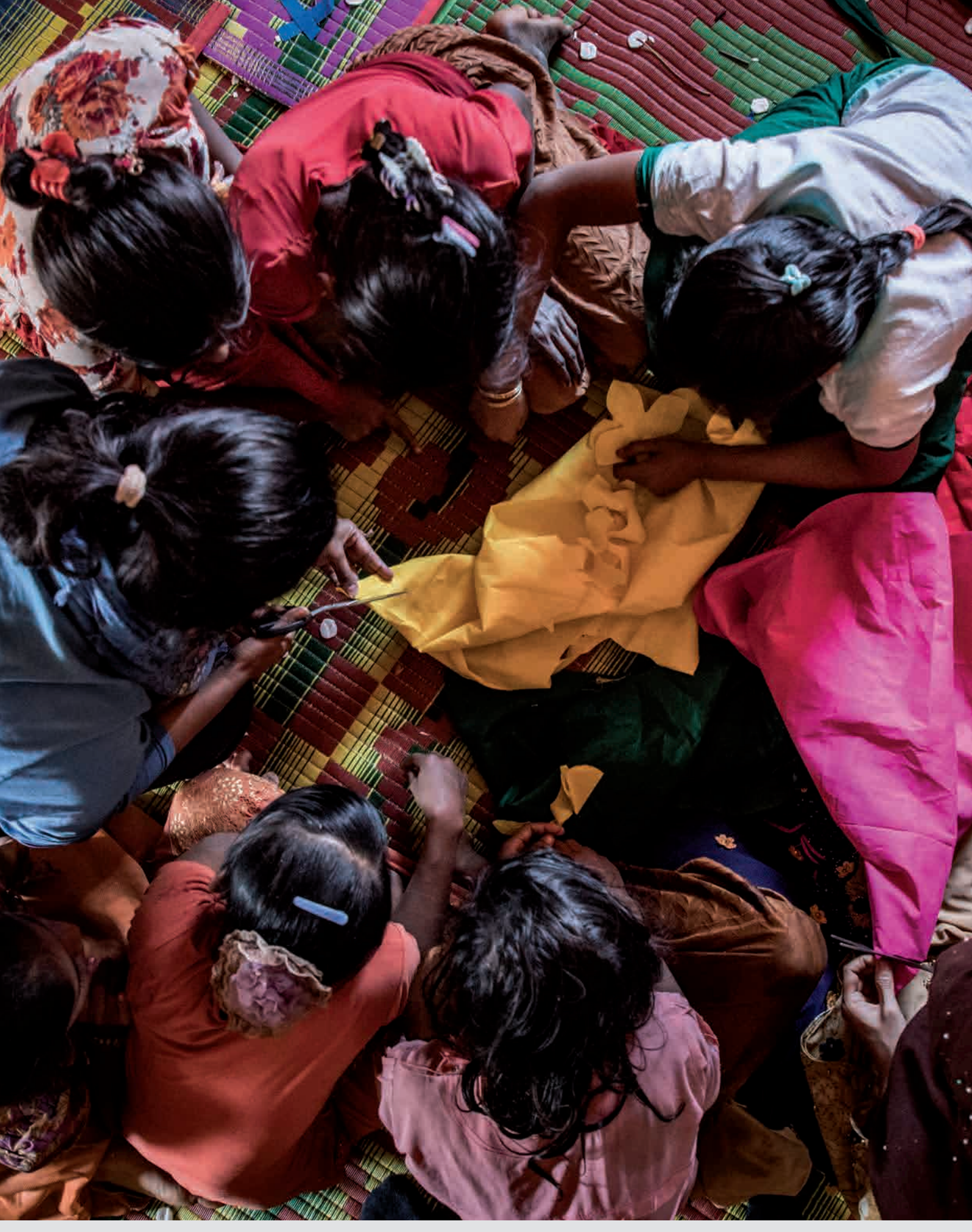
Adolescent girls attend a youth club in Kutupalong refugee camp, Cox's Bazar, Bangladesh. 30 January 2020