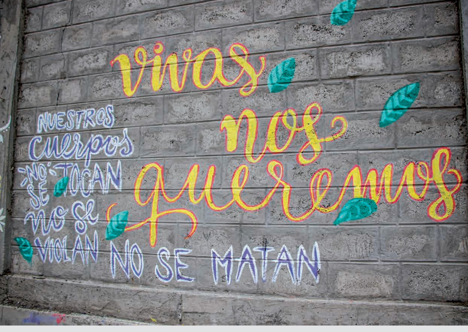
Empowerment messages painted by women survivors of gender-based violence: "We want to be alive. Do not touch, do not rape, do not kill our bodies". Salcedo, Ecuador, 22 July 2020