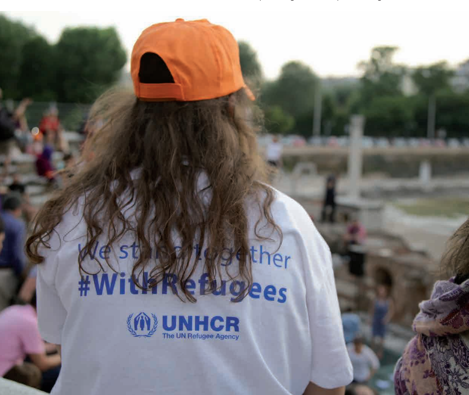
World Refugee Day in Thessaloniki, Greece. 20 June, 2019.

Implementing programmes and interventions addressing GBV is a priority for managers and their teams. Effective results require resources, workforce arrangements, and measurable actions to be implemented across all sectors and areas of work. These will be monitored for quality and also for compliance against a Policy Monitoring Framework.