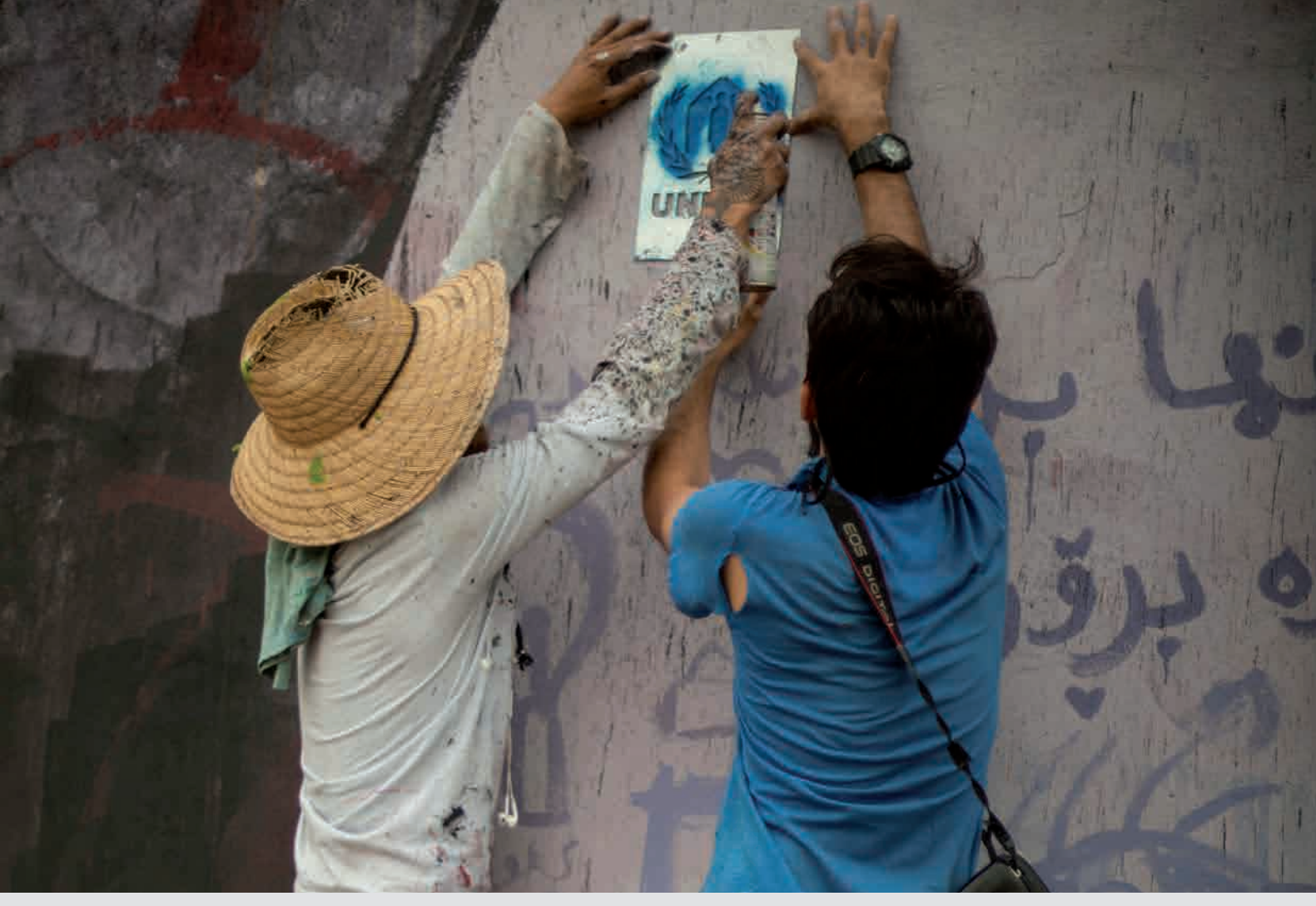
Painting workshops with youth groups in host communities, internally displaced people and asylum seekers across Iraq. The sessions were organized by UNHCR and its national partners, Qandil, LCN (Legal Clinic Network), Intersos, in collaboration with @aptART (Awareness and Prevention Through Art). Sulaymaniyah, Iraq, 24 May 2017

Monitoring is the systematic and on-going process of collecting, analyzing and using information to track progress towards reaching programme objectives, and to inform management decisions. Operations should plan for a combination of routine protection monitoring, programmatic monitoring and situation monitoring in order to track progress and identify the need for new or adjusted programming.