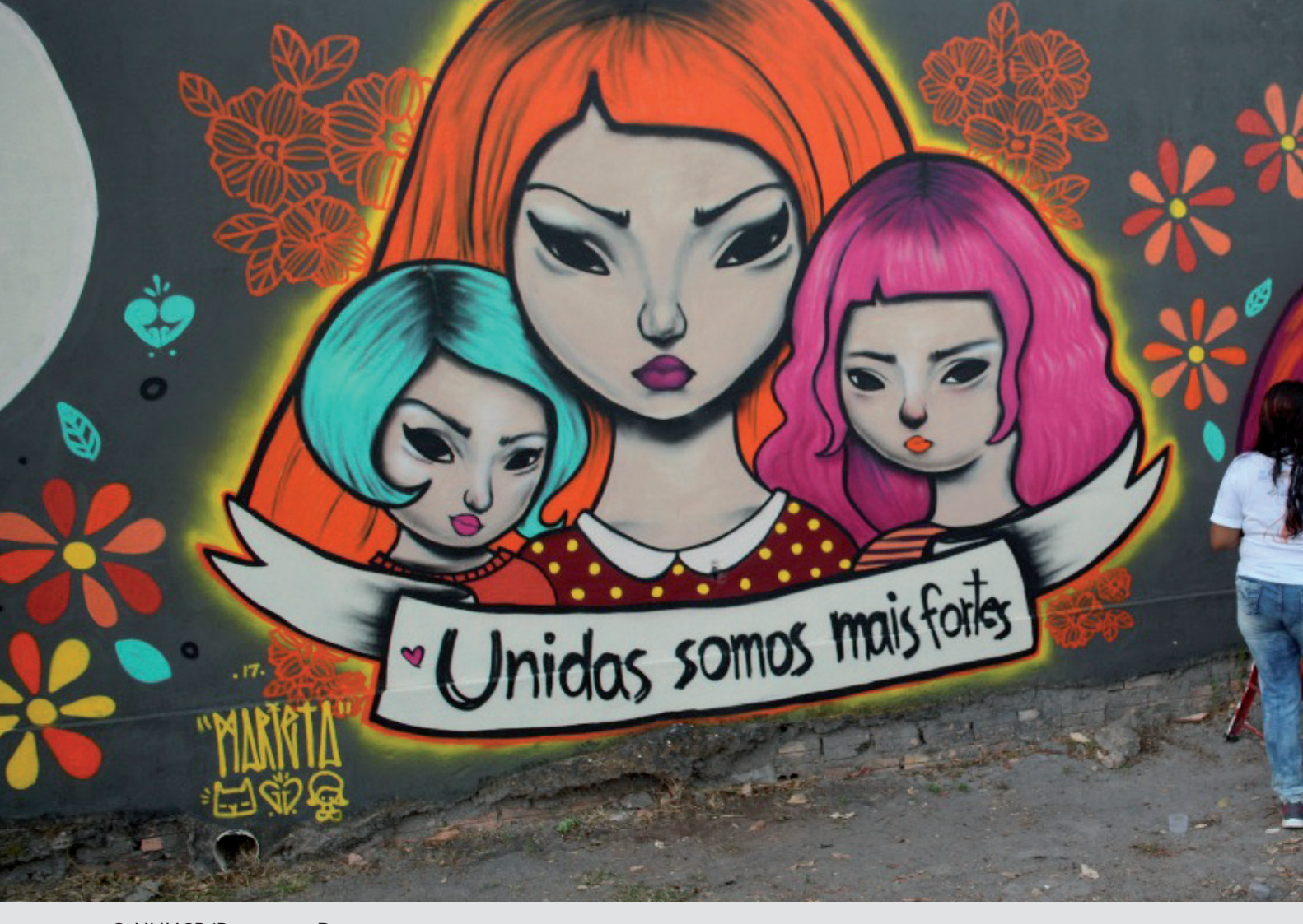
Venezuelan and Brazilian women paint messages of empowerment as part of the 16 days of activism activities against Gender-Based Violence in Boa Vista, Brazil. 7 December 2017