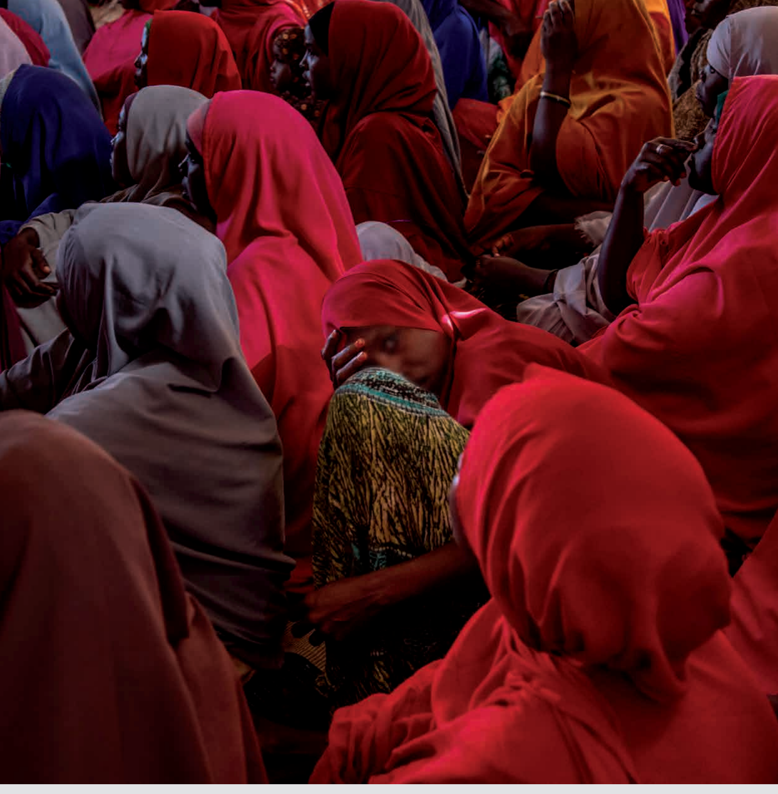
Somali refugee women gather to meet the UN High Commissioner for Refugees at the Women's Wellness Centre run by the International Medical Corps in Melkadida Refugee Camp, Ethiopia. 12 February 2019

More recent forms of gender-related violence, such as abuse that occurs online or through electronic media and communication technologies, are also included. GBV can be committed by family and friends, by members of the community or unknown assailants. It may be perpetrated or condoned by the State, non-State actors, or institutions. When GBV is conflict-related and perpetrated by elements affiliated with a State or non-State