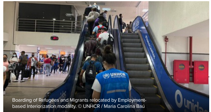
Boarding of Refugees and Migrants relocated by Employment-based Interiorization modality.

In June, UNHCR supported the interiorization of 90 people with their families hired by a local company to Montenegro and Garibaldi in Rio Grande do Sul. These people received financial assistance for the cost of transit accommodations, where they stay for up to 30 days, in addition to the donation of travel kits and blankets, and the support received by social workers in the identification of homes where they go once they leave the transit sites and to access public services in the cities of destination. The Reception and Integration Center of Children's Villages in Porto Alegre also supports the initiative.