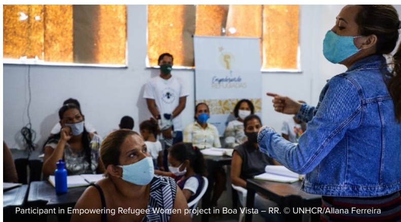
Participant in Empowering Refugee Women project in Boa Vista – RR.

On 7 June, UNHCR, in partnership with the Global Pact Network Brazil and UN Women, launched the VI Edition of Empowering Refugee Women , a project for training and promoting the employability of refugee women, raising awareness in the private sector and expanding voluntary interiorization opportunities. The initial group has 20 women who are receiving professional training in customer service and sales. In the 2021 edition, the project will support 80 women, and, considering their families, will benefit more than 200 people. The project is supported by Lojas Renner, Unidas, MRV, Facebook, Iguatemi and Sodexo.