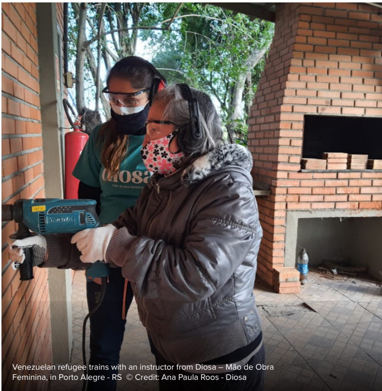
Venezuelan refugee trains with an instructor from Diosa – Mão de Obra Feminina, in Porto Alegre - RS