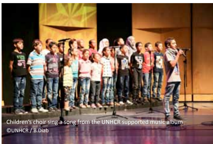
Children's choir sing a song from the UNHCR supported music album