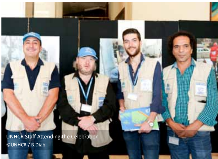
UNHCR Staff Attending the Celebration

In 2008, the United Nations General Assembly designated 19 August as World Humanitarian Day in honour of the 22 UN staff, including the Special Representative of the Secretary-General (SSRG) to Iraq, who lost their lives in the bombing of the UN Headquarters in Baghdad in 2003. World Humanitarian Day is celebrated worldwide and remembers humanitarian personnel who have lost their lives in the line of duty and recognizes the critical work being done to help millions of people in need throughout the world.