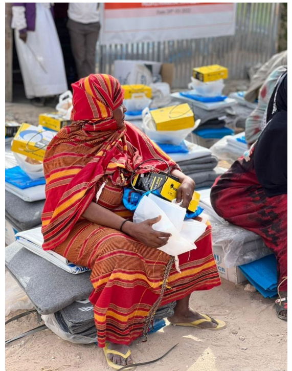
A woman received an NFI kit at Nasahablood A IDP Settlement Area in Hargeisa, Somaliland