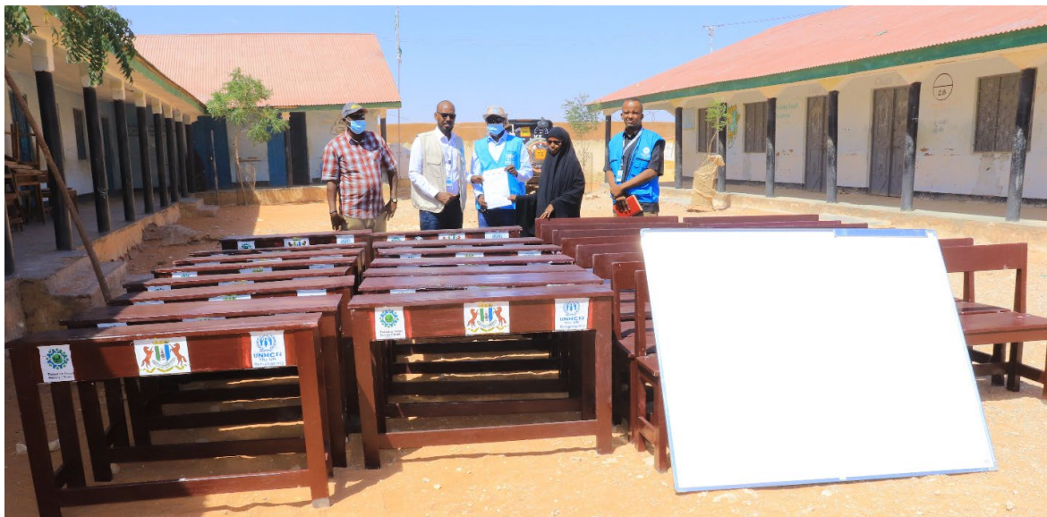
Handover of classroom furniture.