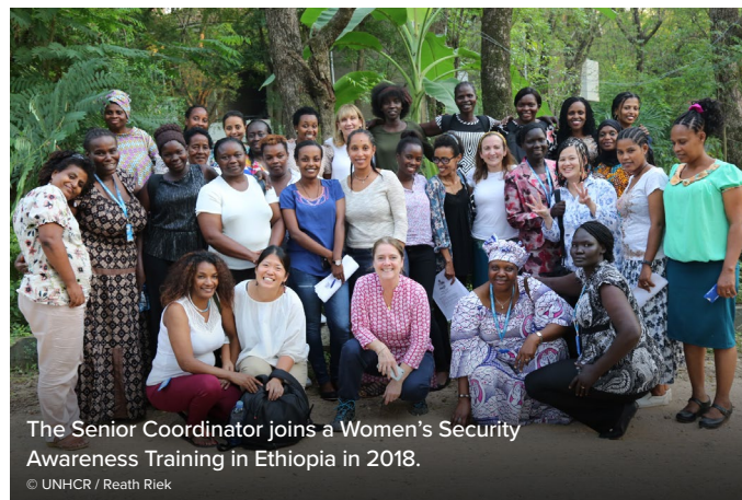
The Senior Coordinator joins a Women's Security Awareness Training in Ethiopia in 2018.

level of interest, with some 2,300 contributions from colleagues, and led to the development of a comprehensive set of frequently asked questions on sexual misconduct. An Intranet page was also created to make information easily accessible to victims, witness, managers and colleagues. Videos and other communications materials were prepared.