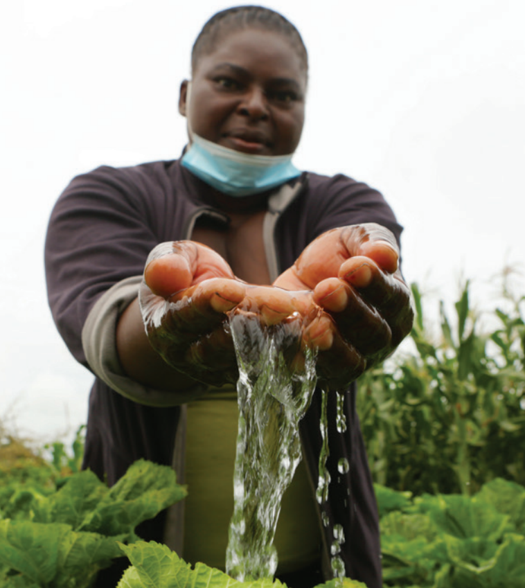
Zimbabwe. Improving water access at Tongogara refugee camp