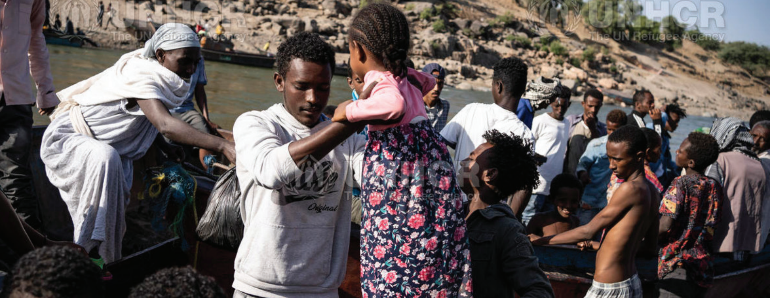
Sudan. Ethiopians flee to Sudan to take Shelter.