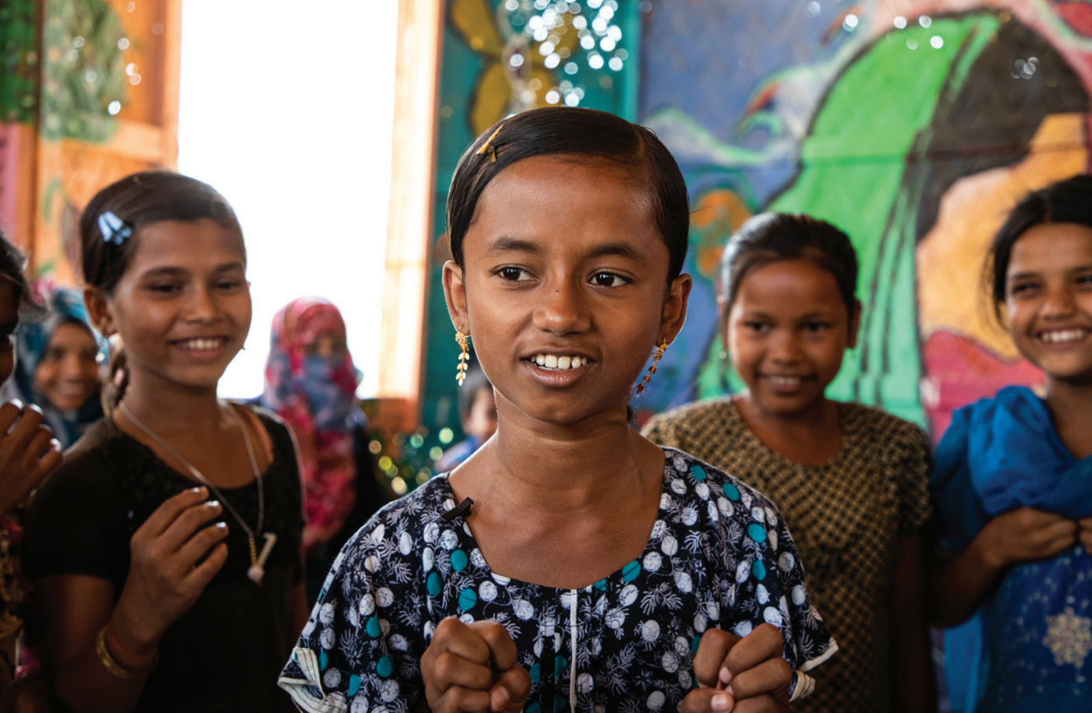
Bangladesh. Mental health project helps Rohingya youths discuss anxieties