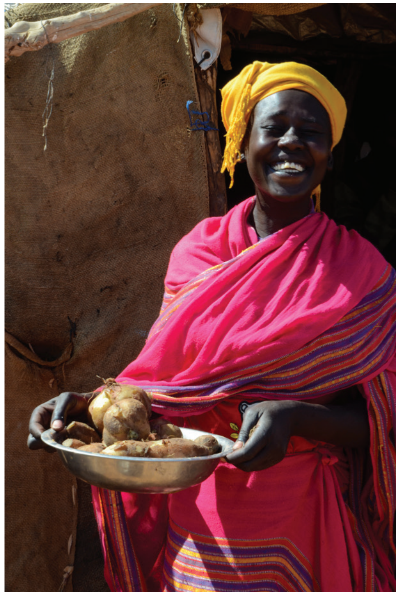
Sudan. Nivasha is one of several refugee settlements in the outskirts of the Sudanese capital Khartoum.

In 2019, of UNHCR's 77 refugee sites where acute malnutrition (wasting and nutritional oedema) was measured. 47 sites (61%) met the UNHCR standards of less than 10% Global Acute Malnutrition (GAM), while 10 sites (13.0%) showed GAM levels equal to or above the emergency threshold of 15%. Treatment options for acute malnutrition exist either through services provided in refugee camps