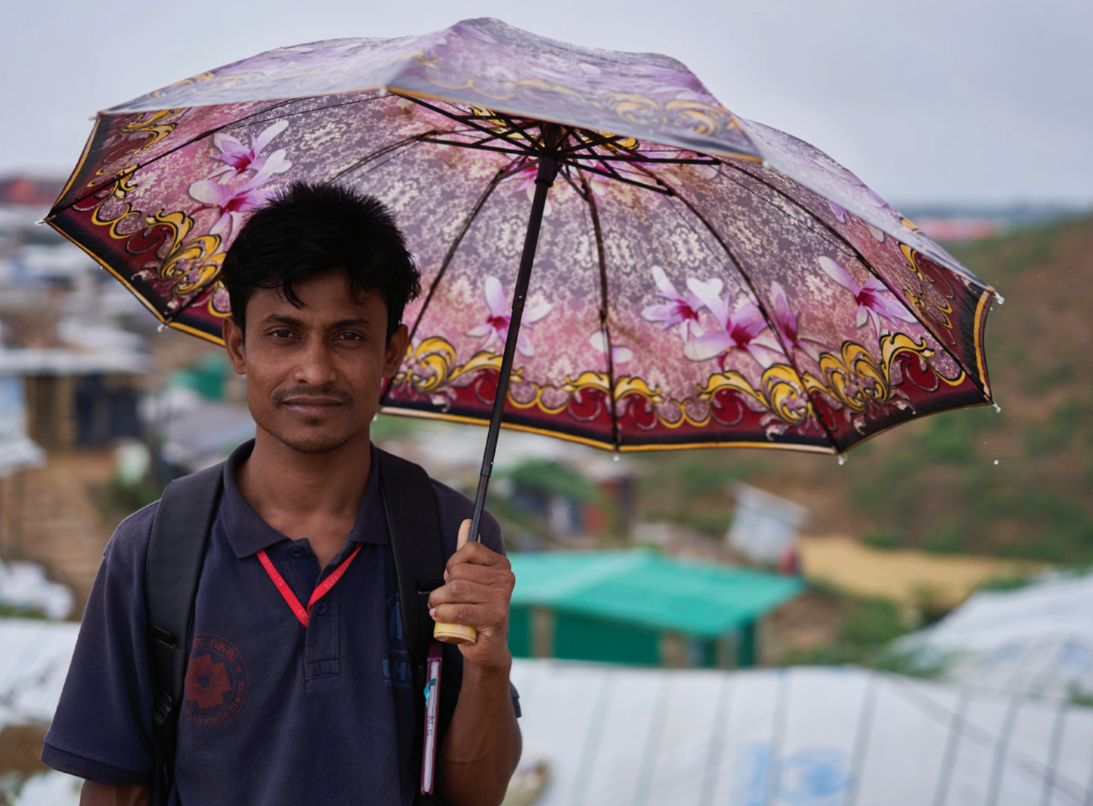
Bangladesh. Community health worker undertakes household visits