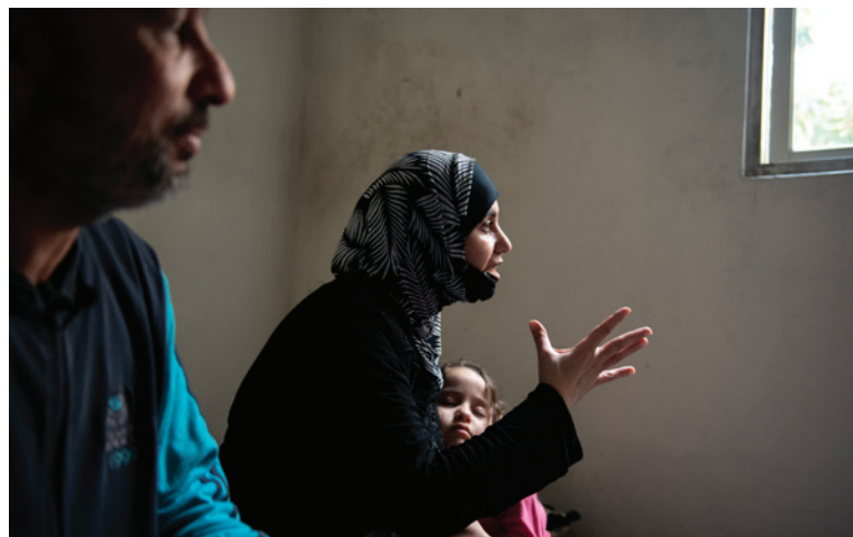
Lebanon. Ten years into Syria crisis, refugee family struggling with poverty and mental health issues

MHPSS is also relevant for other goals such as SDG 16 on Justice, Peace and Stronger Institutions.