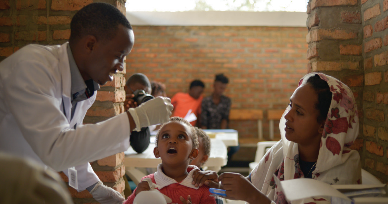
Rwanda. First group of evacuees from Libya arrive in Gashora

During emergency situations, Sphere standards and generally accepted emergency mortality and nutrition thresholds are key in monitoring the response. Once the situation stabilizes health programming targets will be guided by national standards, while increasingly harmonizing these around SDG Goals and Agenda 2030 targets, combined with measuring indicators for UHC 2030. It is important that every public health response consists of a timely set of actions, decisions, and interventions so that the relevant actions are undertaken in the different phases of a refugee emergency. The UNHCR Public Health in Emergencies Toolkit 10 provides guidance and tools that can be adapted to different contexts.