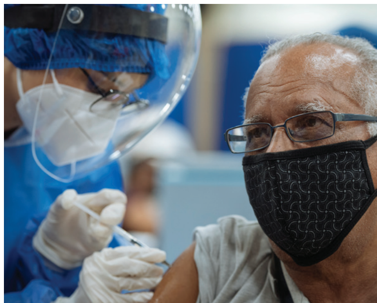
© UNHCR/Santiago Arcos Veintimilla Ecuador. Venezuelan refugee and migrant older people get the Covid-19 vaccine with UNHCR support

UNHCR will develop and leverage key strategic partnerships to ensure this support, including sufficient financing, is provided early in the response and is sustained over time. Many refugee hosting countries have health systems that need strengthening especially in remote areas where refugees are often hosted. They may already have health sector reform or development plans supported by external donors. These will be generally too slow to respond adequately to emergency health needs and additional support will be needed especially early in the response.