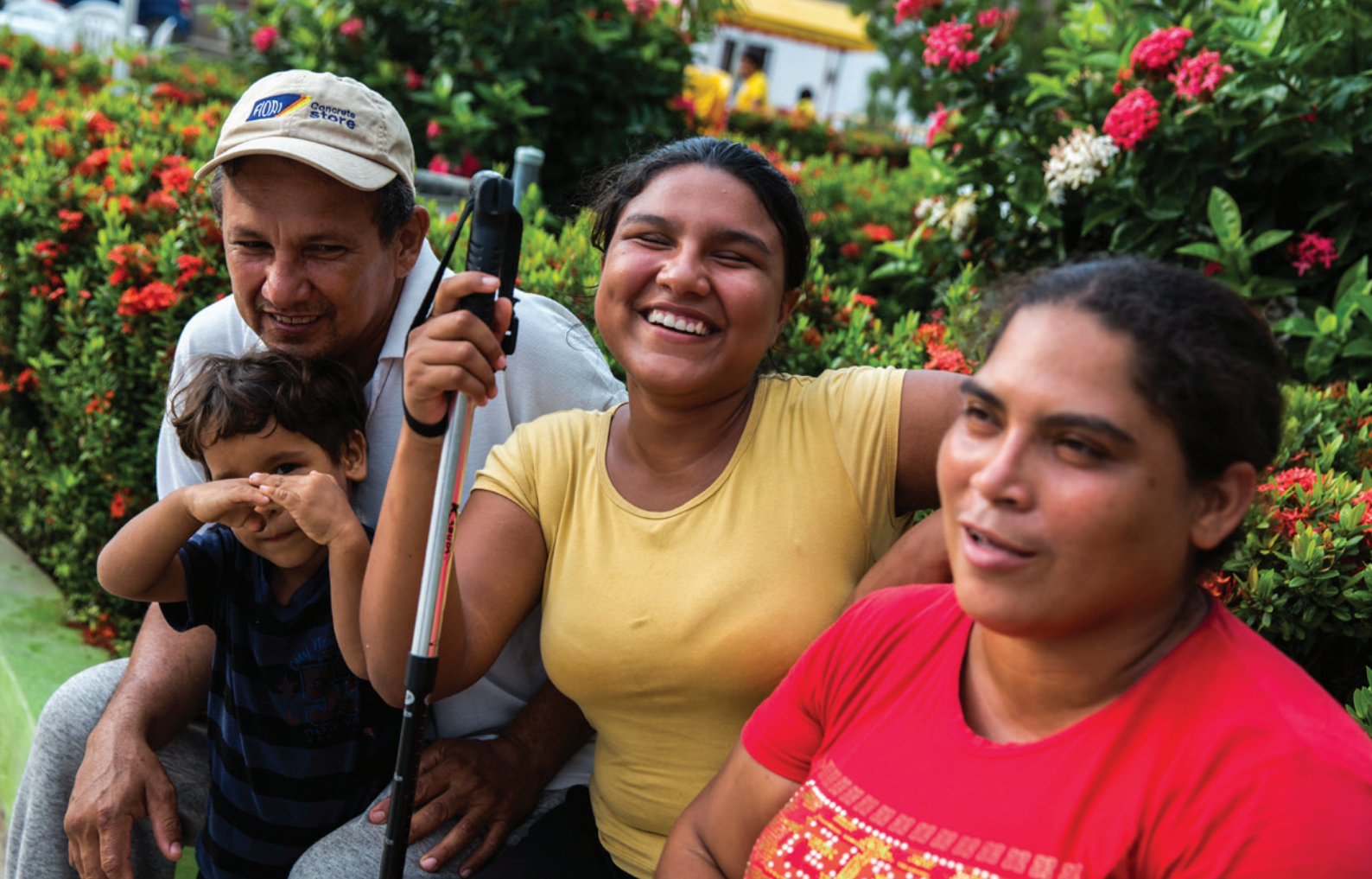
Colombia. 'A life or death situation' – Angelina Jolie on Venezuelan exodus