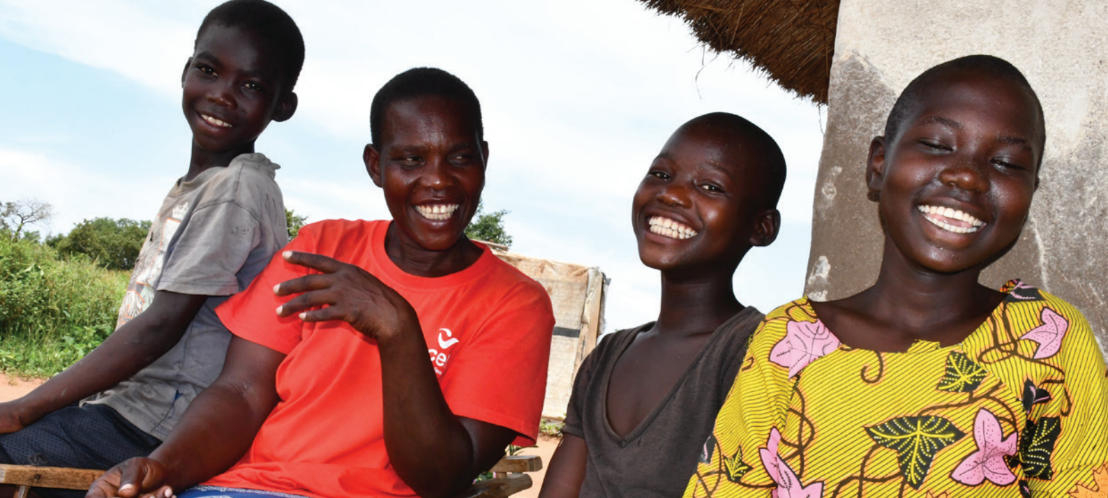
Uganda. Help is at hand for South Sudanese refugees living with HIV.

Services in the Context of COVID-19 and IAWG Programmatic Guidance for SRH in humanitarian and fragile settings during the COVID-19 pandemic