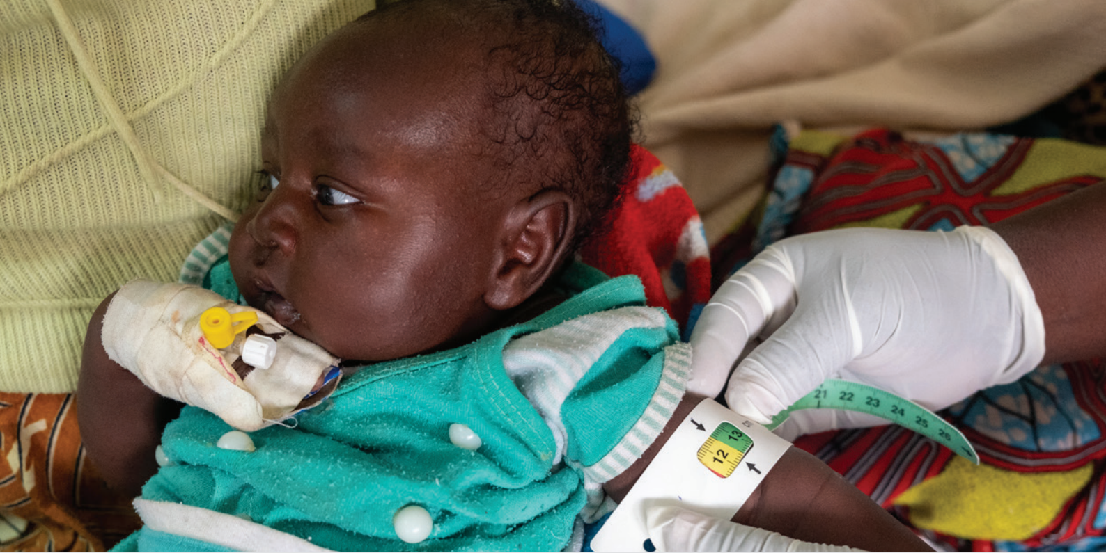
Kenya. Caring for refugee children on a Kakuma paediatric ward