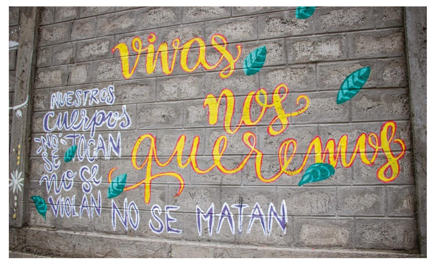
I Messages written by women survivors of sexual and gender-based violence are displayed in artwork on the walls of the Cotopaxi Reception House – a safe house for refugee and Ecuadorian women in the city of Salcedo, Ecuador.

The " Reflective Leadership Dialogues " were adapted and rolled out virtually, benefitting more than 370 managers across 154 offices. Using experiential learning methodology, they engaged managers to reflect on ways to strengthen their role in promoting more safe, inclusive, and respectful work environments.