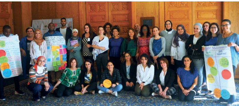
Group Photo: National workshop Turkey.