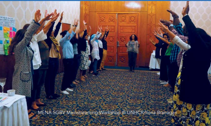
MENA SGBV Mainstreaming Workshop