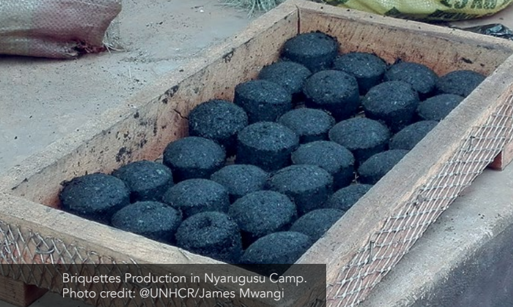
Briquettes Production in Nyarugusu Camp.

Tanzania: In Tanzania, a 2018 survey revealed that 54% of persons of concern to UNHCR feel unsafe during the night-time while using sanitation facilities. Yet, 82% reported feeling safe at night while using sanitation facilities when using the handheld lights/battery torches they already own. To significantly reduce risk of SGBV and feelings of being unsafe at the many shared latrines scattered across Nduta camp in Tanzania, UNHCR (1) distributed 2,176 handheld solar lights at the household level, which included individual solar lanterns and/or mobile phones with a flashlight function; and (2) provided communal lighting strategically placed at latrine facilities by installing 146 lamp posts to illuminate four clusters of shared latrines.