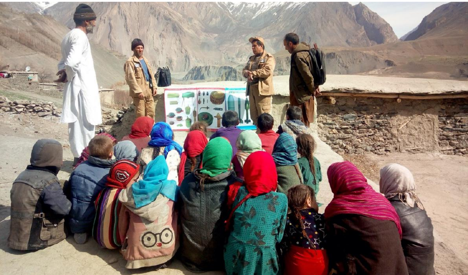
ABOVE PHOTO: The mountainous Darwaz region in NE Afghanistan is still heavily contaminated by anti-personnel mines. These children from the village of Janmarje Bala need to know how to recognize explosive remnants of war and not to approach them when they play outside.

In describing reach and impact at the macro level, or in cases in which directly gathered information on persons with disabilities is sensitive or otherwise unattainable, data may be available from governmental or other secondary sources.