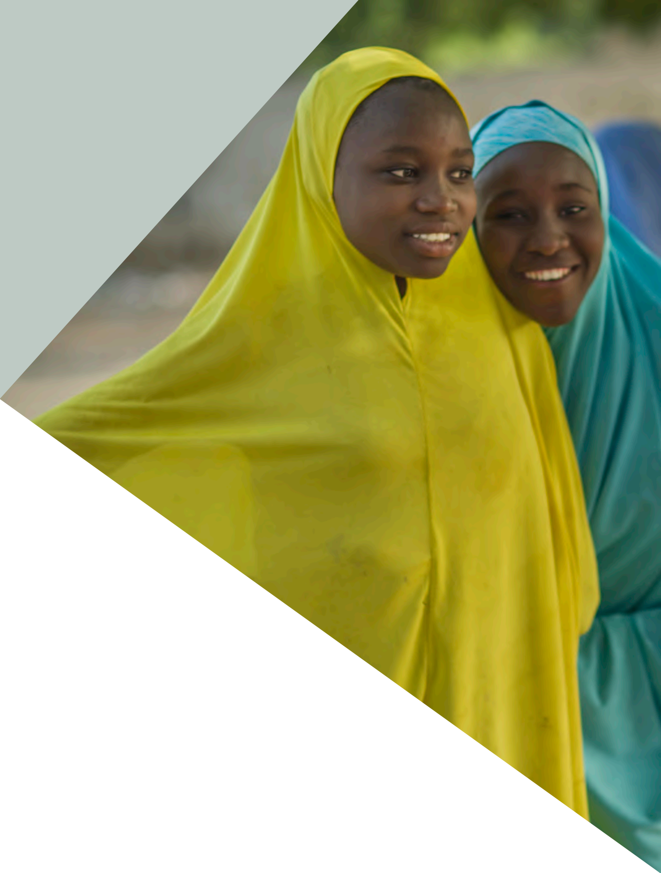
ABOVE PHOTO: Young women in Ngamari Village, Nigeria. © Sean Sutton/MAG