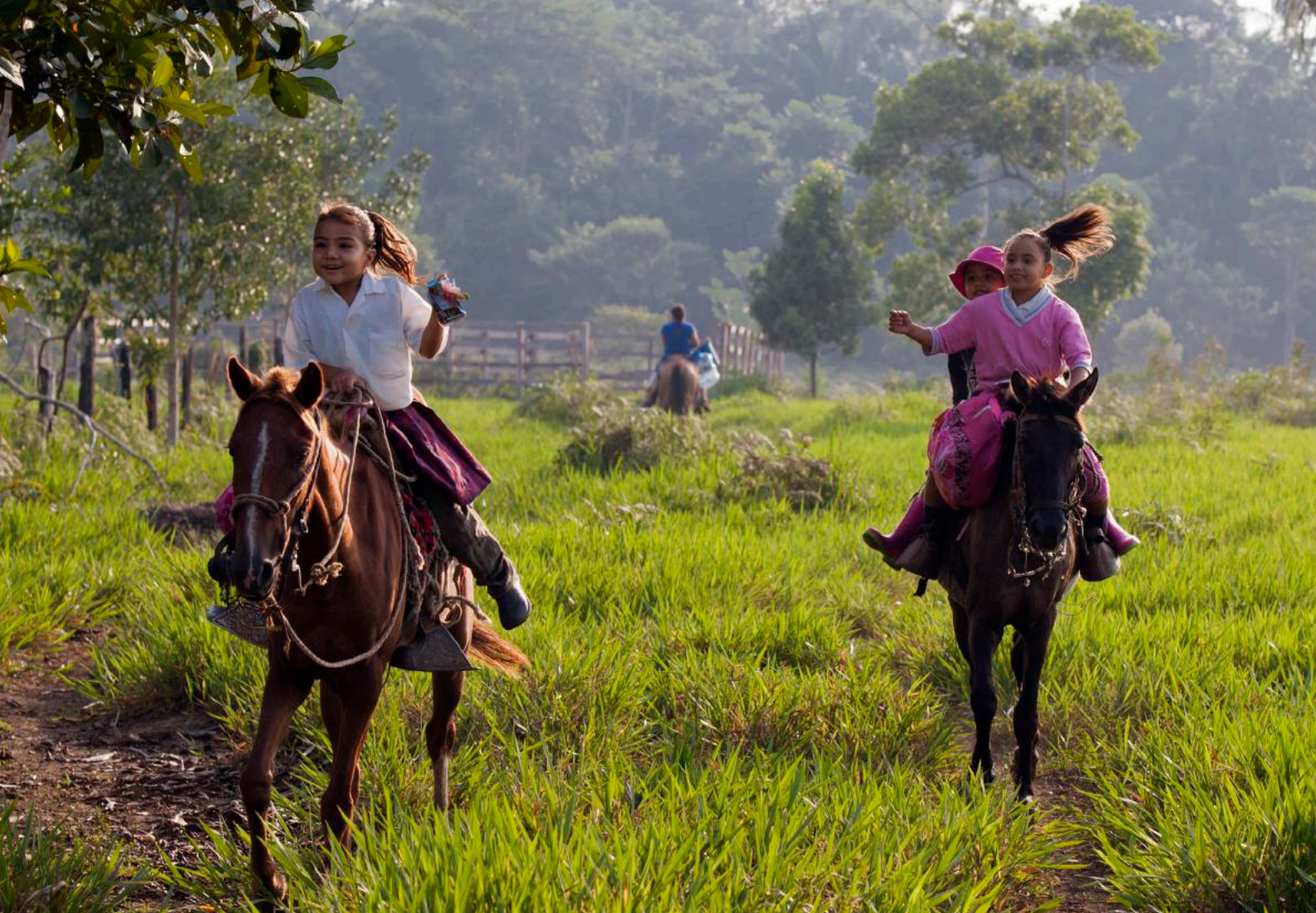
ABOVE PHOTO: Kids from Santa Helena Primary School on their horses in early morning. Some of these children come from two hours away. Santa Helena, Meta Department, Colombia.