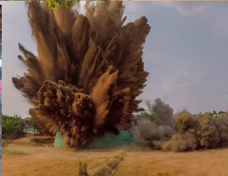
ABOVE PHOTOS (Clockwise from top left): Villagers in Nonsomboum, Laos filling sandbags as part of the protective works required when a large aircraft bomb was found in a field on the edge of their village. The bomb's destruction has removed a significant threat to the villagers, who can now engage in daily activities without fear.