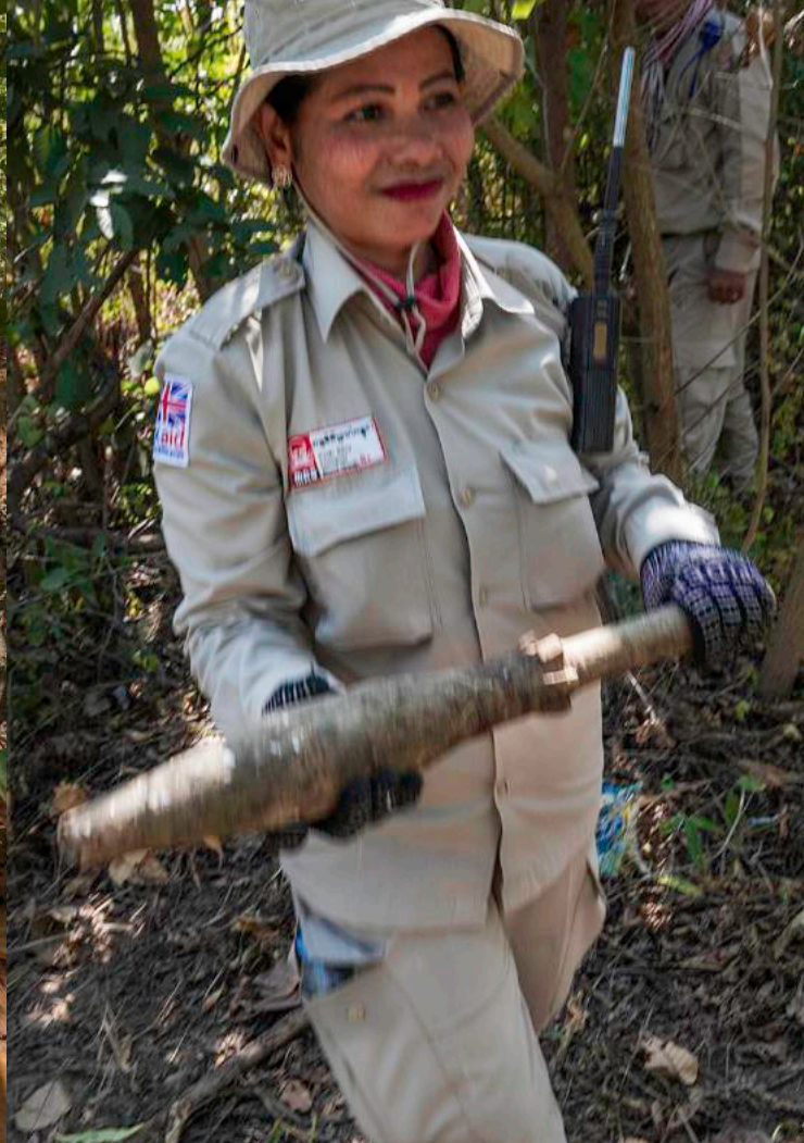
ABOVE PHOTOS: An EOD team check out the rocket propelled grenade and mortars that this Cambodian beneficiary and her husband found in their field, before safely removing them for destruction elsewhere.