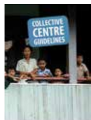
COLLECTIVE CENTRE GUIDELINES