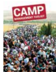
CAMP MANAGEMENT TOOLKIT