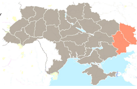
Map of Ukraine showing the Donetsk and Luhansk oblasts

With this project, HelpAge aims to significally improve access to humanitarian assistance and protection for older women and men, including those with disabilities that were affected by the conflict in Eastern Ukraine.