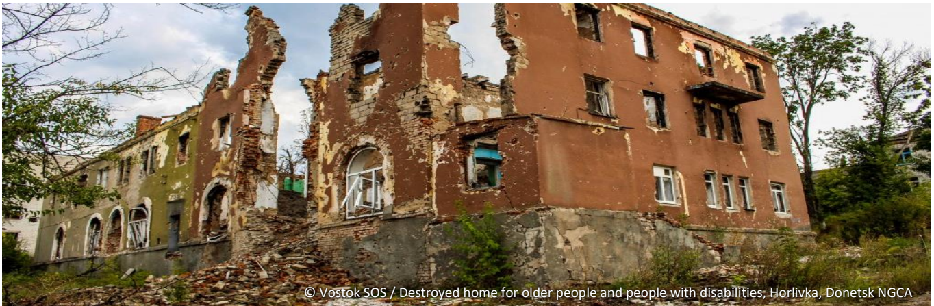
Destroyed home for older people and people with disabilities, Horlivka, Donetsk NGCA

THE PROTECTION CLUSTER INCLUDES SUB-CLUSTERS ON CHILD PROTECTION, GENDER BASED VIOLENCE AND MINE ACTION