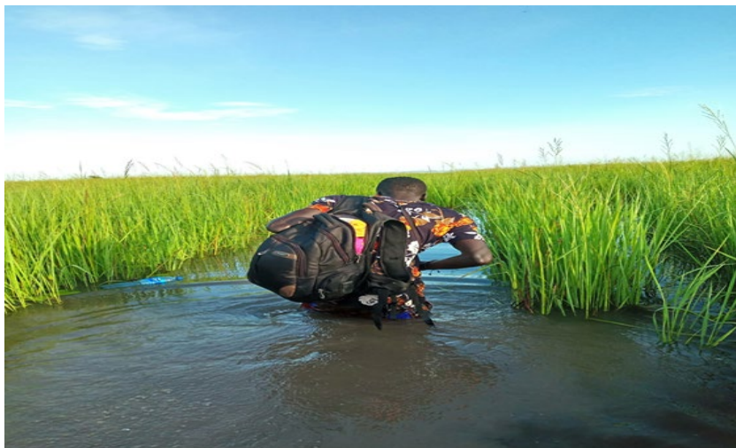
ADRA protection monitor walk from Jekow to Urieng for monitoring visit

The Protection Cluster has developed and shared to the larger humanitarian community a Guidance Note on Protection Considerations for Flood Responses in South Sudan to assist humanitarian partners in their response efforts. The guidance note highlights key protection concerns, vulnerabilities, and responses: protection mainstreaming principles of safety, dignity, and do no harm; meaningful access; accountability; participation and empowerment have been emphasized.