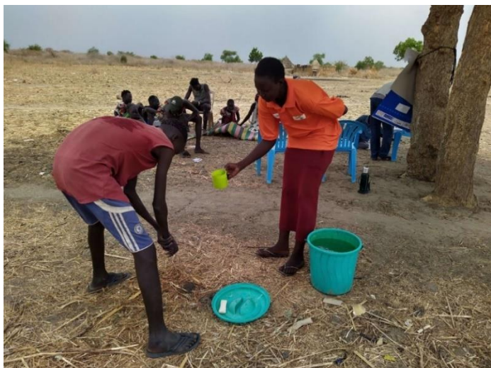
Nonviolent Peaceforce, together with its Women and Youth Protection Teams, raising awareness on Covid-19 to prevent stigmatization and control misinformation/South Sudan/2020/NP