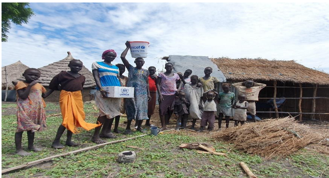
Female returnee to Adong: "We used to have a garden, we used to fish and used to have cow when we lived in Adong before the crisis. We missed these things when we were out of Adong displaced. But today we have the same again. This makes me very happy."