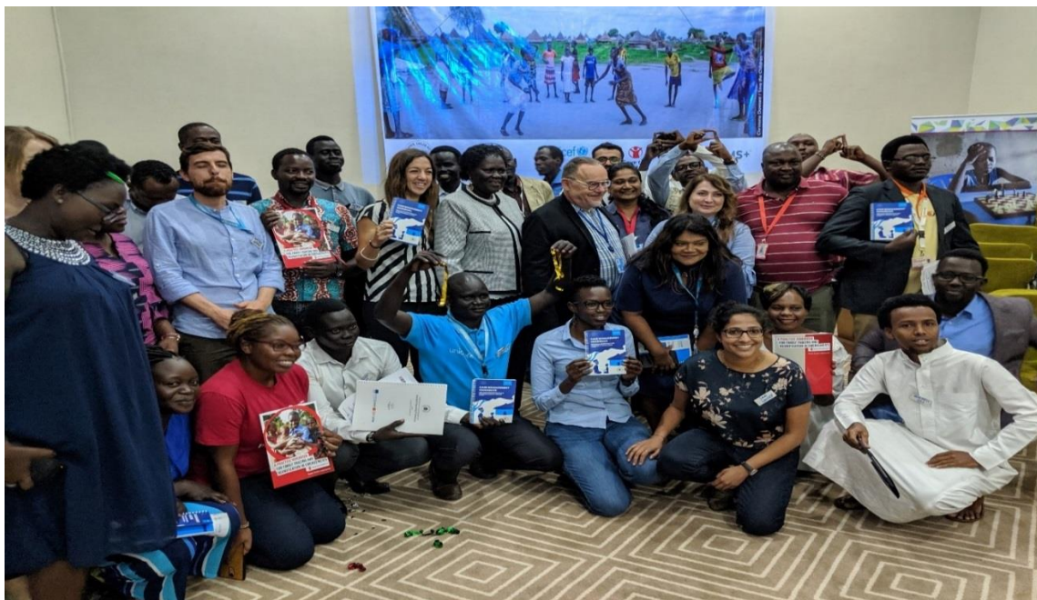
Child Protection partners celebrate the launch of the CPIMS + in Juba, South Sudan

The information sharing protocol (ISP) on case management has been finalized after a lengthy participatory and consultative drafting processes. The case management taskforce of the CPSC led the process; case management partners have committed to adhere and use the ISP document in all aspects related to case management. Case management partners are required to signs the ISP document and many of them have already appended their signature into the document.