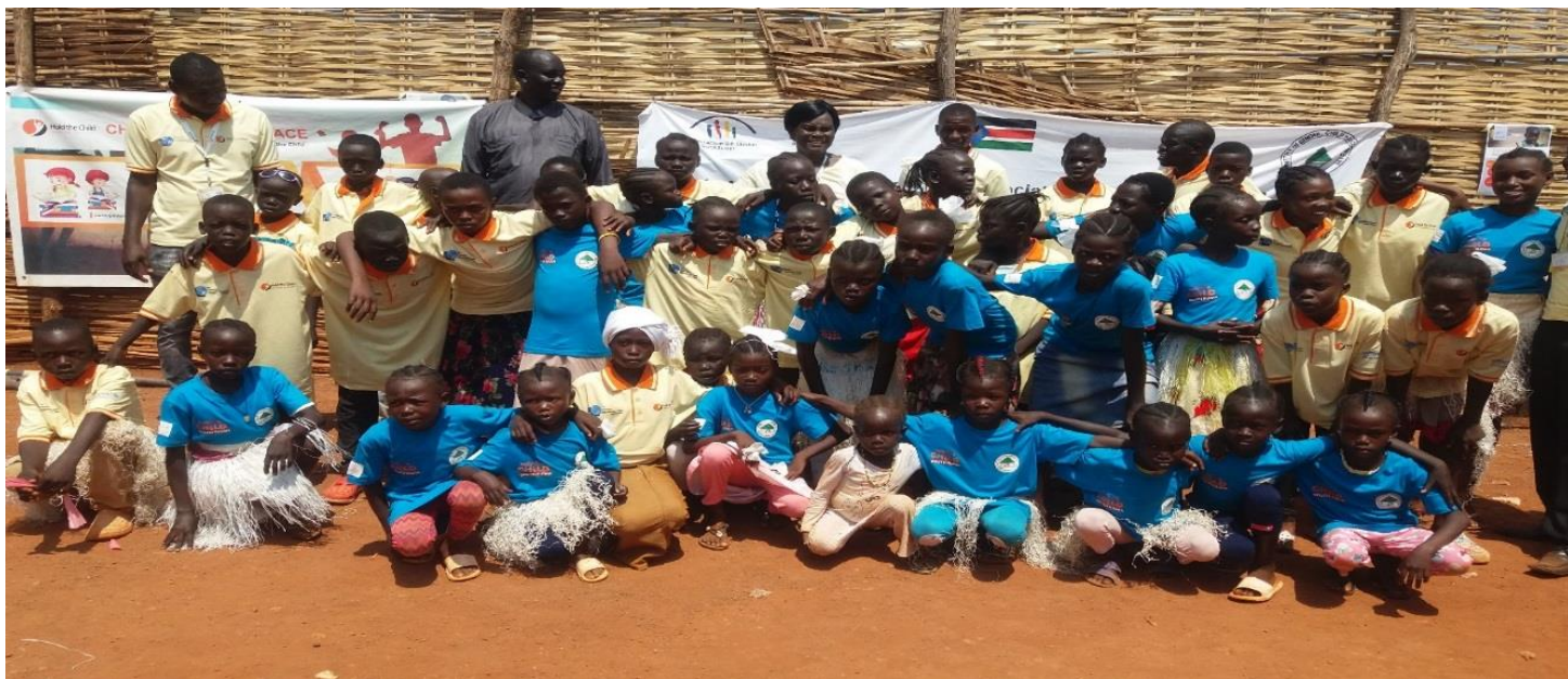
DAC 2019 Celebration photo

Child Protection partners and ministry of gender, social and child welfare organized multiple events in commemoration of the day of African child (DAC 2019). The 2019 theme for the day of African child in South Sudan was Children's Rights First by Ending Child Marriage in South Sudan . A total of the 8 major events was organized in the country where representatives from UN agencies, International NGOs, National NGOs; Government ministries, community leaders and children participated. Children led activities mainly in forms of drama, sports activities, media talk-shows and public talks were performed throughout the events. Selected number of children spoke during these events who unanimously reiterated the needs to protect children from all forms of abuse, violence and exploitation in South Sudan. The Child Protection Sub-cluster co-organized the commemoration with the ministry of gender, social and child welfare both in Juba and in the field locations. A total of 5000 children and 1500 adults participated in the various activities of the events.