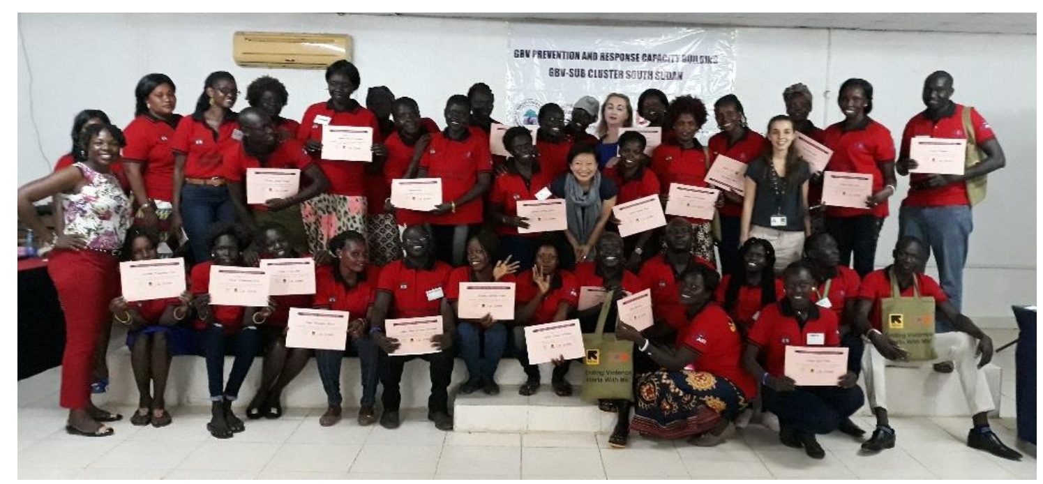
Photo: Participants of the 5-day Case Management for GBV Response Workshop