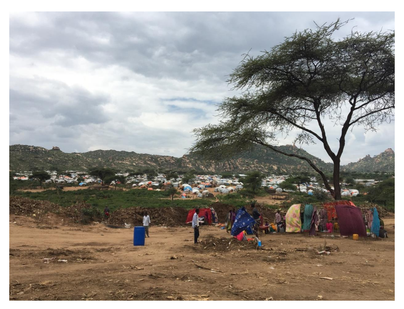
Figure 1 Qoloji 1 IDP site