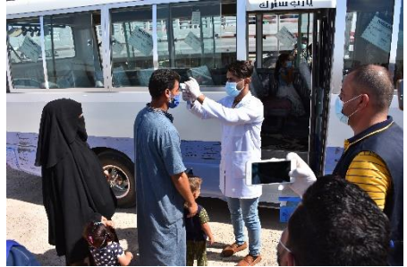
Iraq: IDPs returning from Amriyat al-Fallujah camp

A new Durable Solutions Task Force is advancing solutions for IDPs in line with a Plan of Action endorsed in May. In July, over 50 IDP families returned to their areas of origin in Anbar Governorate from Amriyat al-Fallujah camp. In Sinjar, the local authorities, NGOs and UN agencies, including IOM and UNDP, are working with the government of Iraq to ensure returning IDPs are supported and can access services.