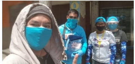
Philippines: Monitoring IDPs' rights in the context of COVID-19

The Commission on Human Rights returned to on-site monitoring of the rights of IDPs, with compliance of health and safety protocols, when the lockdown was lifted in June 2020. Through the UNHCR-CHR IDP Protection Project, the Commission worked in coordination with local government executives, community leaders, and members of community-based IDP networks, which included remote monitoring in Region VIII and Mindanao regions. IDPs reported dwindling humanitarian support, poor risk communication to communities, inadequate access to water supply, and lack of hygiene items in IDP sites.