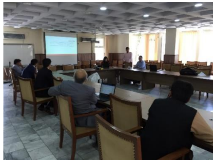
Afghanistan: Consultation at the Afghanistan Independent Human Rights Commission, June 2020

To further implementation of its National IDP Policy and corresponding Action Plan, the Ministry of Refugees and Repatriation with Welthungerhilfe developed a Monitoring and Evaluation Mechanism and a Complaints Response Mechanism. The Administrative Office of the President as well as the Afghanistan Independent Human Rights Commission have been consulted on these tools. Sectoral ministries, such as the Ministry of Women's Affairs, the Ministry of Public Health and the Ministry of Education, amongst others, are reviewing the National IDP Policy Action Plan. International stakeholders will be consulted next.