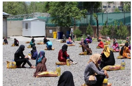
Afghanistan: Food ration distribution in Kabul, June 2020.

The onset of the rainy season combined with overcrowded living conditions in IDP settlements and limited water and sanitation facilities has increased IDPs' vulnerability to COVID-19 . The Municipality of Kabul sanitized an IDP camp in Kabul multiple times to prevent the spread of COVID-19 cases with support from the Jesuit Refugee Service. "We are less concerned about the virus than the lack of food and livelihoods opportunities," said one resident of an informal IDP settlement in Herat. Food rations were provided to over 10,000 IDP, returnee and host families in Herat, Kabul, Bamiyan and Daikundi provinces thanks to multi-stakeholder support.