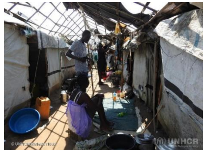
South Sudan: IDPs at Mahad camp in Juba, August 2019