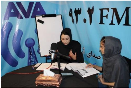
Afghanistan: Accessing education by radio in the COVID-19 environment

The work of some organizations assisting and protecting IDPs has been interrupted as a result of the COVID-19 pandemic and related restrictions and consequences. However, awareness raising, protection monitoring and psychosocial support designed to help IDPs cope with the effects of COVID-19 has continued. In addition, students from remote IDP communities in Herat and Bamiyan districts used radio to access education programs organized by local NGOs, community leaders and the Jesuit Refugee Service, and 20 IDP youth benefited from a two-month electrical and wiring training program conducted through Herat Technical Institute.