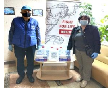
UNHCR distributed face masks, protective gloves, respirators, cleaning and sanitizing products to service care providers at HIV health care facilities in Luhansk oblast.