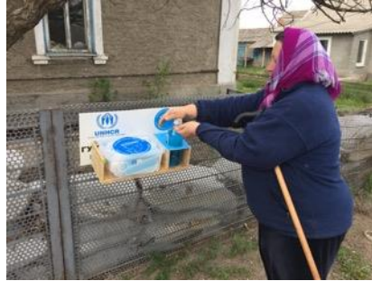
This box with disinfectant gel, face masks and a temperature screening device was set up to check those who move between Staromarivka and Hranitne villages in Donetsk oblast. UNHCR negotiated renewal of civilian movement between the two locations.