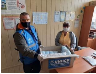
These face masks produced by conflict-affected communities in Donetsk and Luhansk oblasts were distributed to persons with specific needs in localities along the contact line.