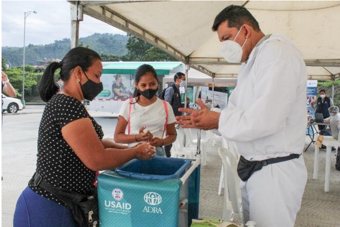
Handwashing instructions for a participant of the project: Place – Municipality of Piedecuesta – Santander, ADRA.

In Ipaless , in the department of Nariño, the migrant population was assisted with safe access to sanitation facilities, achieved by the improvement of communal toilets. In Arauquita, handwashing infrastructure was installed for adults and children, as well as stations for washing clothes inside the shelters.