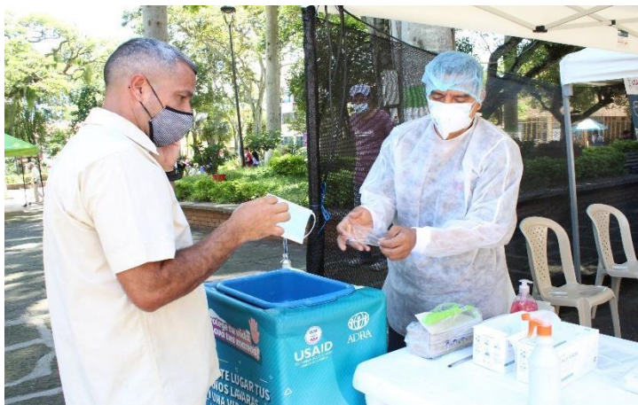
Handwashing and face masks: When a participant arrives at the Mobile Medical Unit, they first wash their hands and replace their face mask to prevent the spread of the virus, and protect the health of those providing medical assistance. Place – Municipality of San Gil – Santander, ADRA.