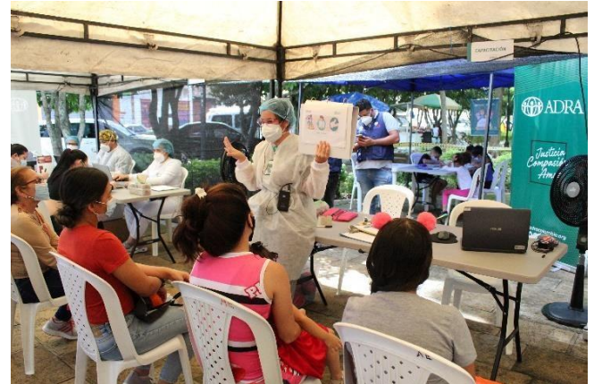
Participants receiving training around COVID-19. In this space the symptoms and self-care preventative measures are explained, which must be put in practice. Place – Municipality of San Gil – Santander, ADRA.