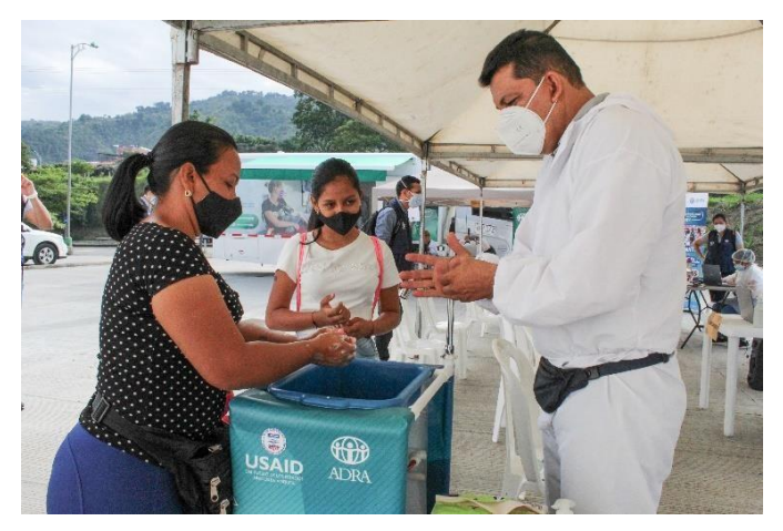
Handwashing instructions for a participant of the project: Place – Municipality of Piedecuesta – Santander, ADRA.

In Ipales, in the department of Nariño, the migrant population was assisted with safe access to sanitation facilities, acheived by the improvement of communal toilets. In Arauquita, handwashing infrastructure was installed for adults and children, as well as stations for washing clothes inside the shelters.