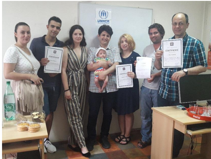
Asylum-seekers and refugees celebrating the completion of their Serbian language course, ©UNHCR, July 2019