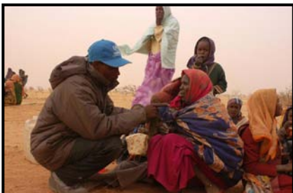
UNHCR aid worker assisting Sudanese refugees in Chad.

is currently in the process of concluding five voluntary repatriation operations; namely to Angola, Eritrea, Rwanda, Sierra Leone, and north-west Somalia. But we are also seeking additional resources from the international community to start preparations for organised voluntary repatriation to Burundi, the Democratic Republic of Congo, Liberia and Southern Sudan.