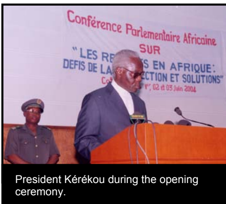
President Kérékou during the opening ceremony.

Within the sombre overall picture of the problems that riddle and undermine our continent, Africa, the refugee issue is undoubtedly one of our major concerns and, for this reason, deserves unfaltering attention and bold action.