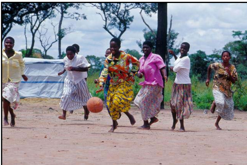
Adolescent Congolese refugees playing at Kala camp, Kawambwa in Zambia.