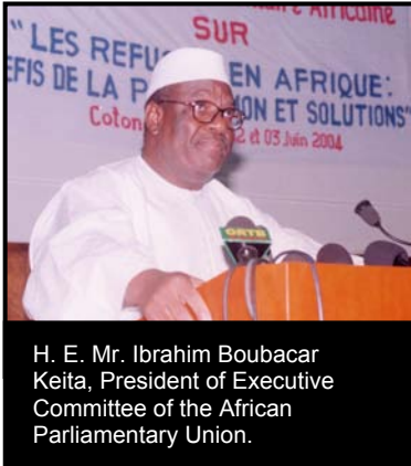
H. E. Mr. Ibrahim Boubacar Keita, President of Executive Committee of the African Parliamentary Union.

We are called upon, as parliamentarians, to reinforce the role of our respective parliaments in giving priority, on the one hand, to ratifying the international law instruments relating to humanitarian law, refugee law and human rights law and, on the other hand, to set in place a national system for the protection of refugees through the passage or amendment of national legislation in line with established international and regional norms.