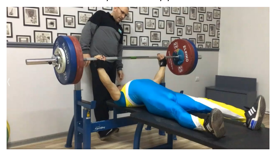
Example camera recording view