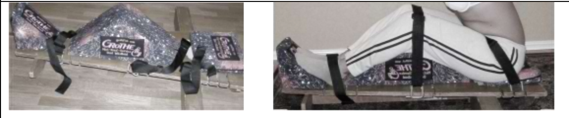
Figure 1: Test-Table-Test Board

2.10 Table 1. describes the tests to be conducted with the test table and the scoring system: