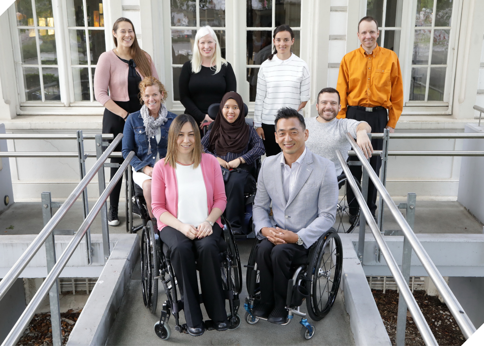
IPC Athletes' Council meeting, June 2018, Bonn