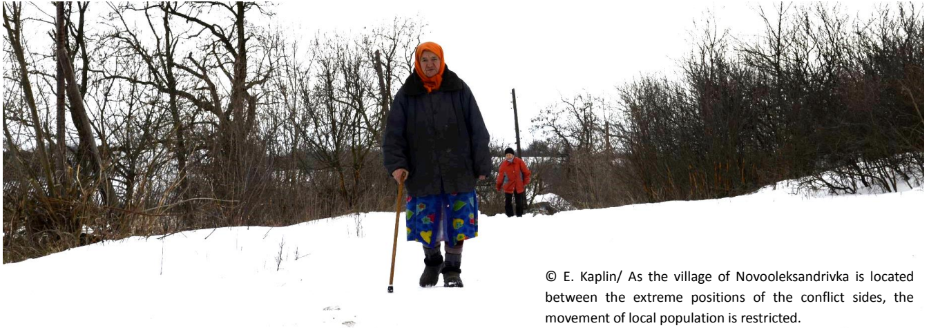
As the village of Novooleksandrivka is located between the extreme positions of the conflict sides, the movement of local population is restricted.

THE PROTECTION CLUSTER INCLUDES SUB-CLUSTERS ON CHILD PROTECTION, GENDER BASED VIOLENCE AND MINE ACTION