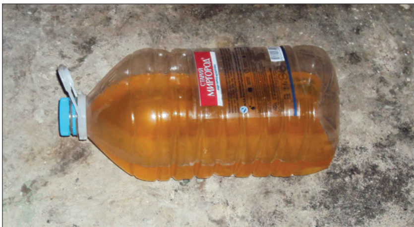
A bottle filled with urine. A typical toilet for the detainees. Former illegal place of detention at the bomb shelter of PrJSC "Lysychansk Glass Factory Proletariy"