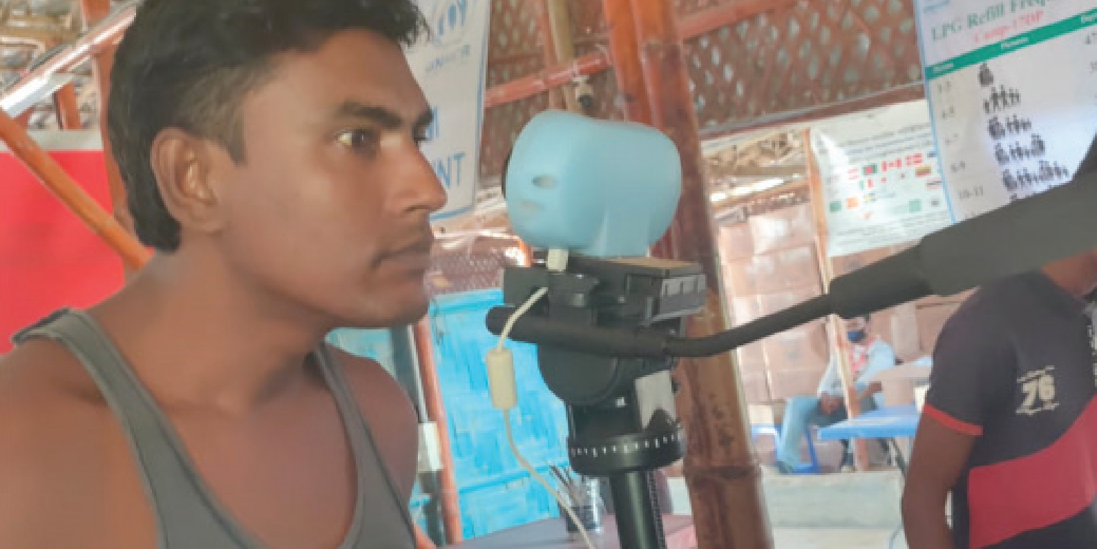
Testing contactless biometrics in Bangladesh