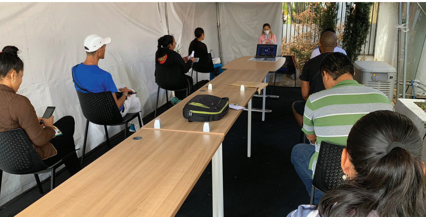
Preparing to assist the most vulnerable in Costa Rica

The transfer value will depend on family size. Families with elderly (family members over 60 years) and with documented chronic medical conditions will receive monthly payments for the duration of the crisis. In addition to contact details in PRIMES, UNHCR will use a range of communication channels with the beneficiaries to inform them of this opportunity, including social media campaigns, broadcast SMS messages and outreach through community leaders.