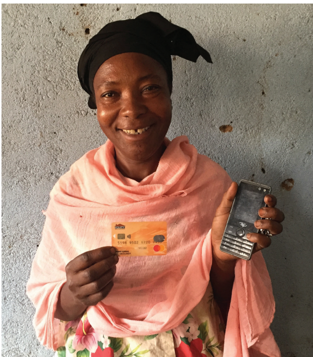
Digital payments in Uganda

The government of Morocco has declared a state of national health emergency responding to the increasing number of persons contracted COVID-19. UNHCR has therefore advanced the payments under the existing cash assistance for the most vulnerable, and reprioritized within the current available funds to support all refugees with a one-time off cash assistance to alleviate the economic impact of COVID-19.