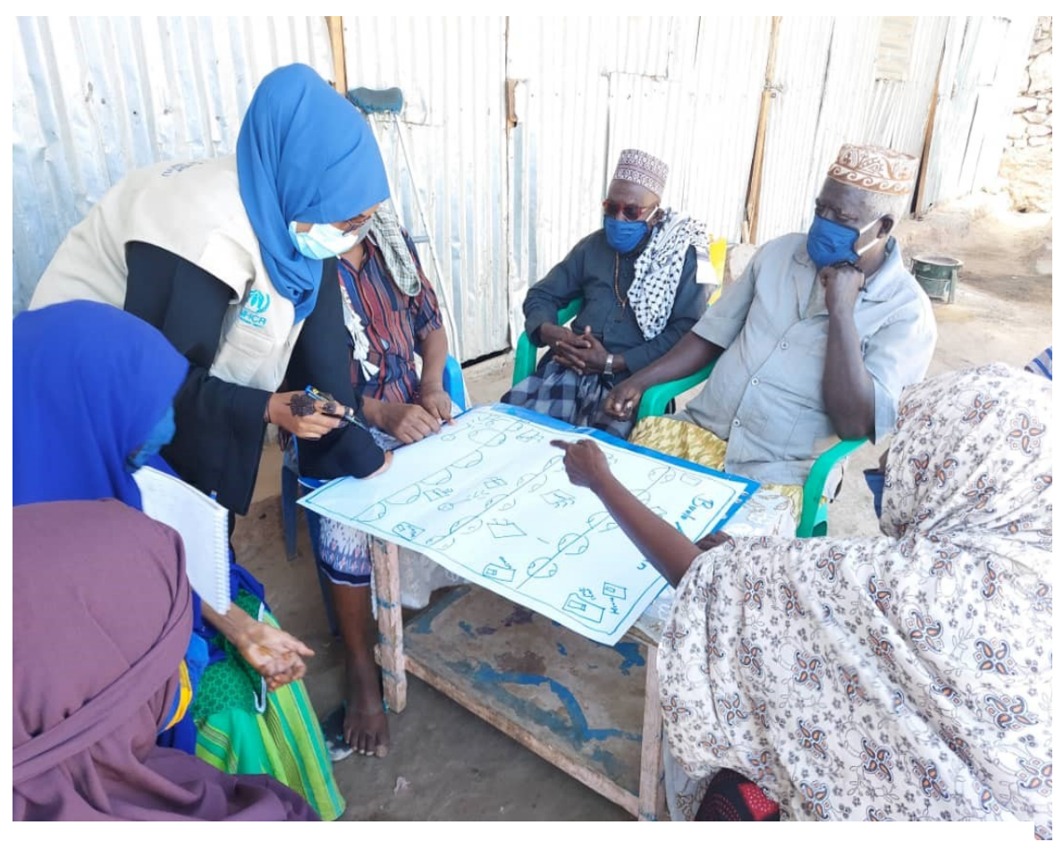
Field monitors and camp management committee conduct mapping of available services in Buulo-Ajuran camp in South Galkayo.