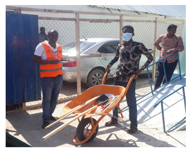
IDP community receives a material kit to help improve and maintain hygiene in the site.