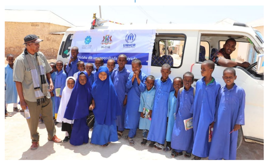
Students participating in a back-to-school campaign in Galkayo.