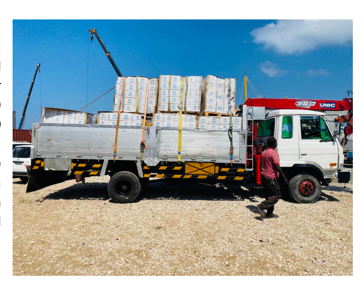
NFI kits arrive in Bossaso as part of the Cyclone Gati response.

In response to Cyclone Gati, UNHCR successfully completed distribution the of cash for emergency shelter 3,600 to households 21,600 (some individuals) in the affected areas. will The response complemented with the distribution of NFI kits; the shipment arrived in Bossaso in February distribution will start in March.