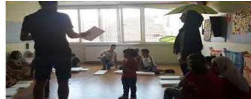
Recreational activities at HRDF Istanbul

IOM assisted 2,050 refugees with psychosocial support. IOM also provided legal assistance to 313 individuals through its partnerships. Legal awareness sessions focusing on civil registration procedures, including marriage, divorce and birth certificates were also provided.