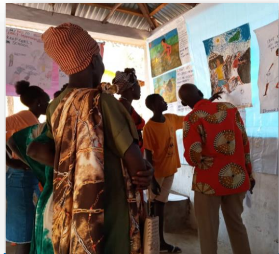
A young boy explaining his drawing to the public ©UNHCR/ Mekdes ASCHALEW, Protection Assoc.

Of all the participants, twelve boys' drawings were chosen to be showcased at the exhibition. Of these, three were identified as winners and received prizes in line with such recognition. The he