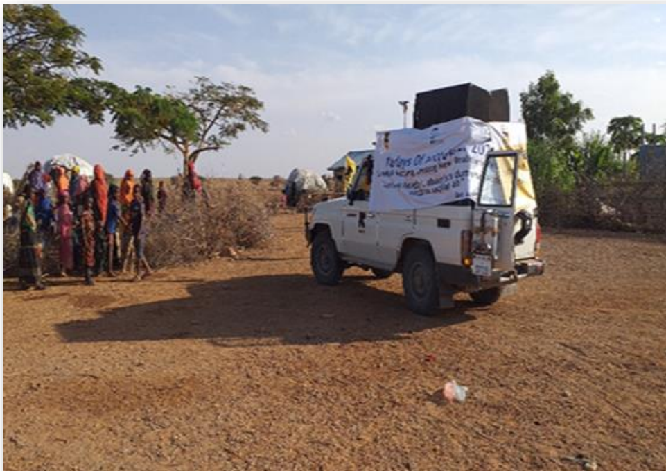
Celebration in Buramino Mini campaign on World AIDS Day