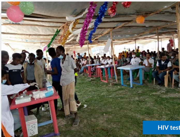
HIV testing in Aysaita

Aysaita in the Afar region as a part of the 16 Days of Activism. At the centre of the 2020 World AIDS Day was the need to celebrate and acknowledge the vital role that communities have played towards the response to HIV/AIDS. There was mass testing of participants for HIV/AIDS