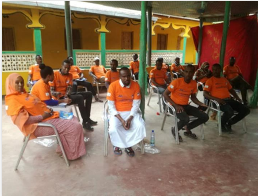
Partners attending the training.