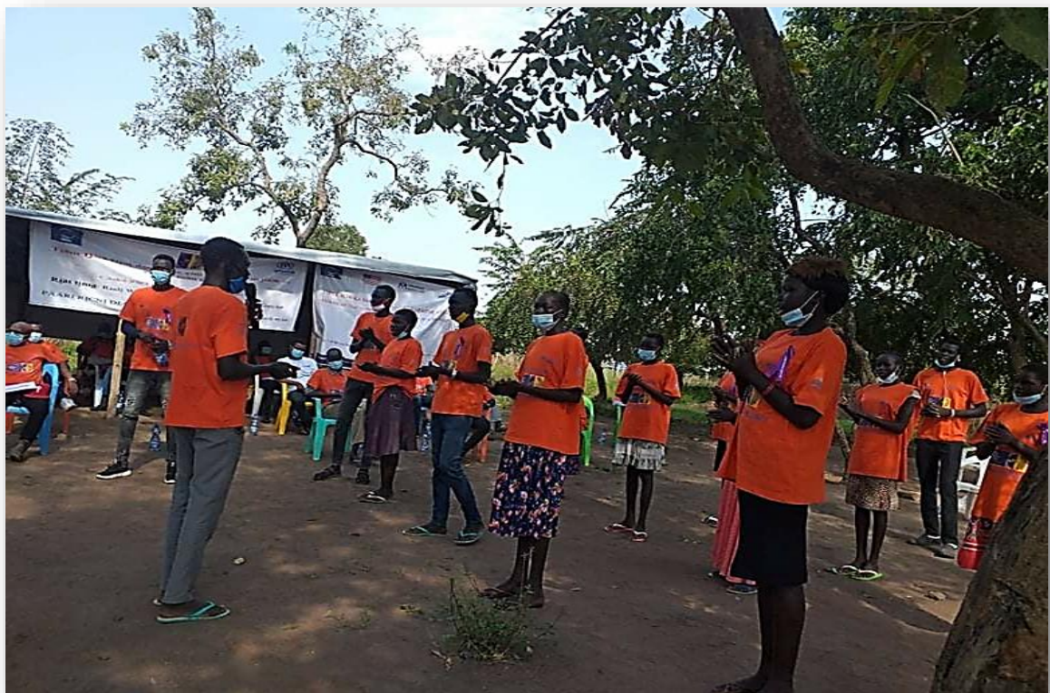
Song by Gender Club members about the importance of girls education and the impacts of early marriage. At Pugnido II refugee camp.

75 refugees (40 women and 35 men) attended the performance of the members of the adolescents' gender club.