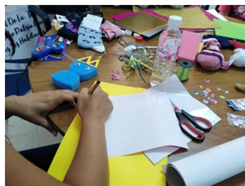
Puppet workshop organized by CTR in Sousse for refugee and asylum seekers children

Between January and September 2020, UNHCR Tunisia registered 2,256 asylum seekers as part of an enhanced backlog clearing exercise. However, due to the increasing number of individuals seeking international protection in Tunisia, 1,971 people are still awaiting registration while 2,780 are waiting to access the Refugee Status Determination (RSD) procedures. Since 2019, UNHCR Tunisia has strengthened both its registration and RSD operational capacity. In September 2020 UNHCR launched a database system to support its partner Tunisian Refugee Council (CTR) in the recording of its reception activities that will systematize waiting lists and identify and prioritize people with specific needs.